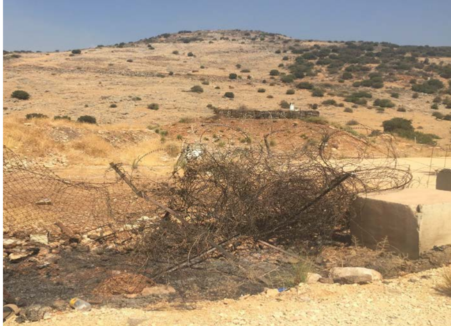
A broken fence surrounding a minefield

Even though many minefields in the Golan are marked, they continue to pose a grave danger to the villagers who live and work near them. On February 11, 2008, the Peace Court of the city of Haifa ordered the Israeli government to award NIS62,240 (USD $14,939) to compensate two brothers in Majdal Shams for the injuries they sustained in 2000, when landmines swept down a hill from a minefield into their courtyard. The court concluded that the Israeli Army was aware of the dangerous positioning of the mines but took no preventive measures. 80