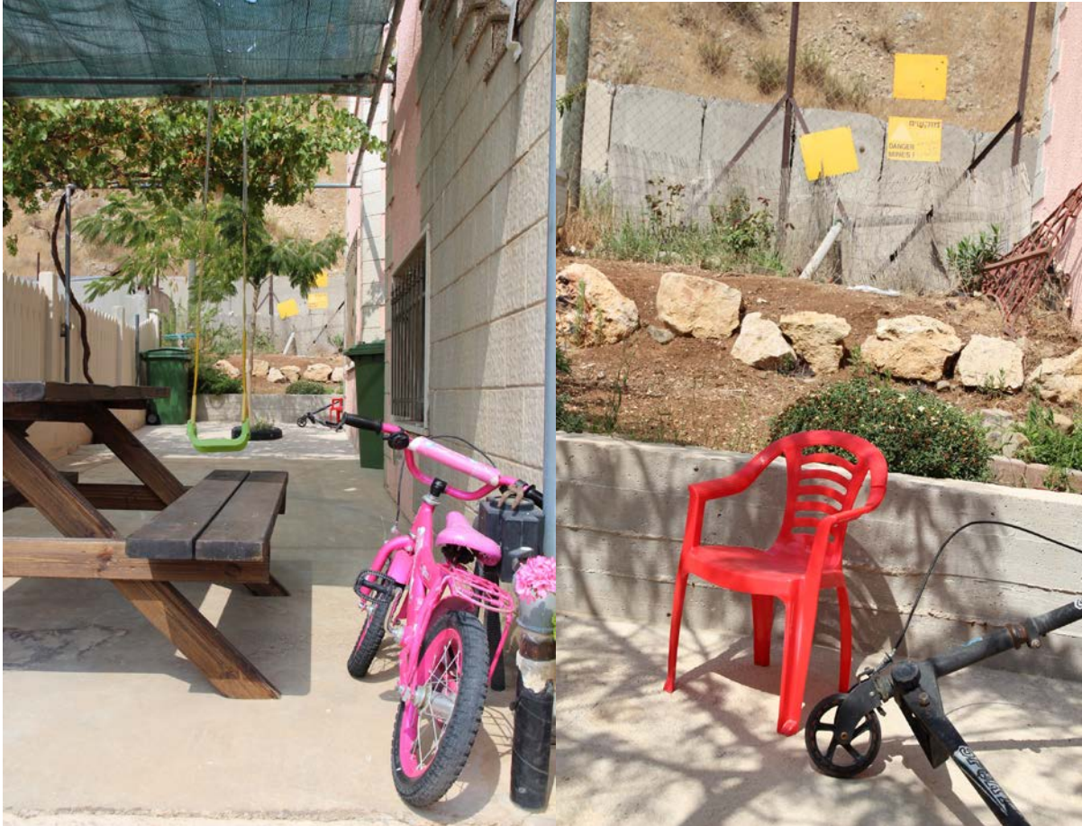
A landmine field adjacent to a home in Majdal Shams