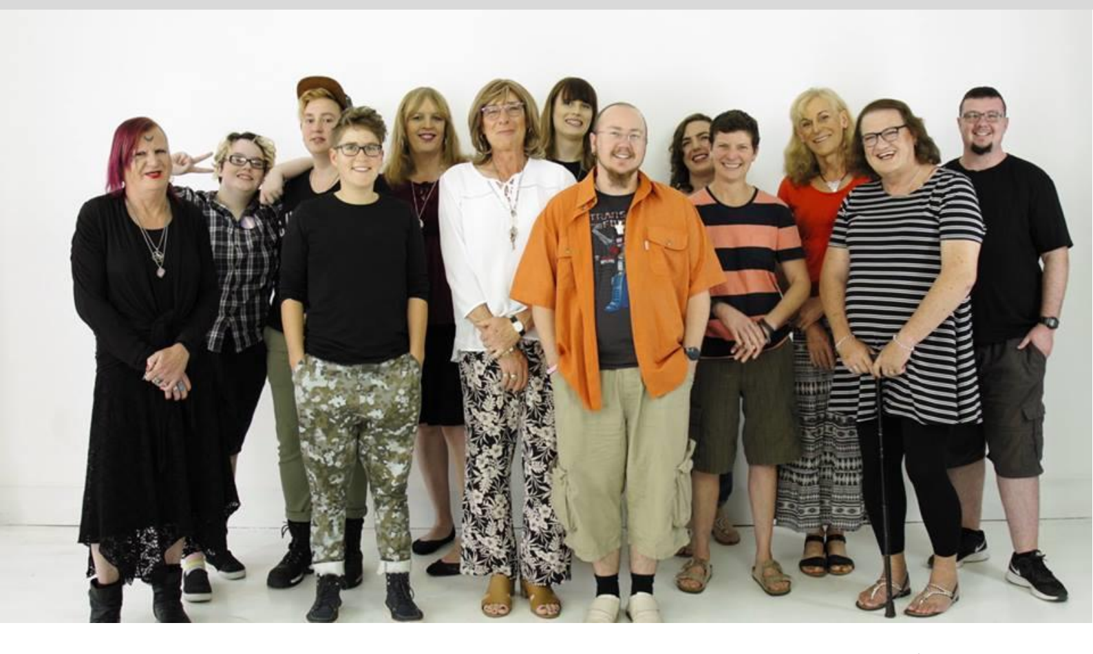
Group of trans and gender diverse people share their stories for the Self Definition Project (April 2017, Adelaide) (see http://www.selfdefinition.tv/).