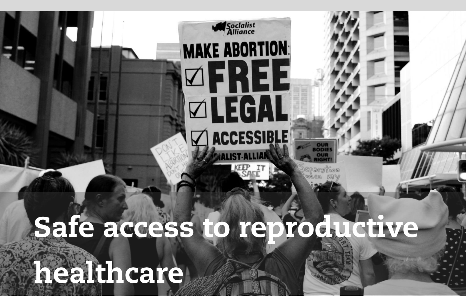
Women protest for rights to access abortion services in Queensland (May 2017, Brisbane)

All women and girls should have the right to access essential health services, including basic reproductive healthcare.