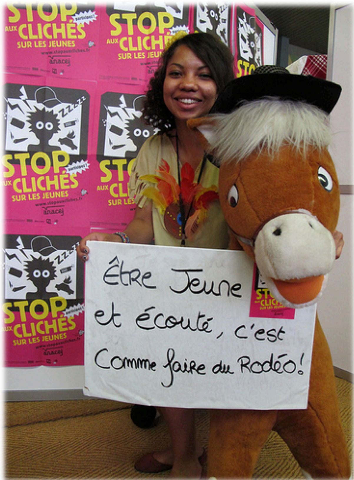
Being young and heard is like participating in a Rodeo!