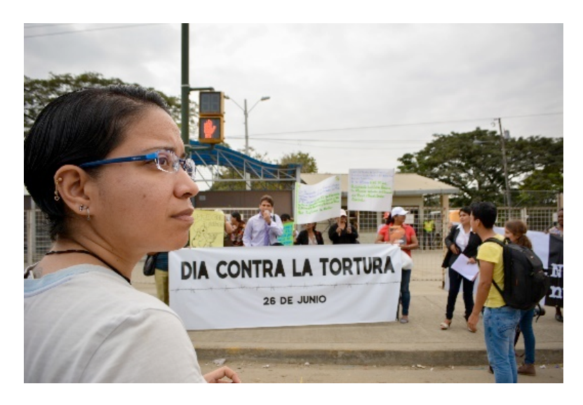
Act against Torture Outside of Prison del Littoral in June 2014 with the participation of women's organizations by denouncing "intimate search warrant "of women entering prison. Guayaquil

However, more importantly the FIDH found that Ecuadorian prisons needed to provide visitation rights to prisoners because it brought families together, as well as provided an overall better quality of life for prisoners<sup>22</sup>.