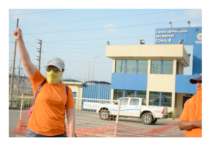
Photo of a protest at the Regional Prison on May 2015 by the Committee of Relatives "United we are more." Guayaquil

Furthermore, on May 11, 2015 the Committee of Relatives of Deprived Liberty formed a protest saying, "We are more together." They held a sit in at the provincial government building and then relocated to outside of The Rock. The thirty women were wearing orange like their incarcerated relatives. Some covered their faces in fear of retaliation for their incarcerated loved ones.