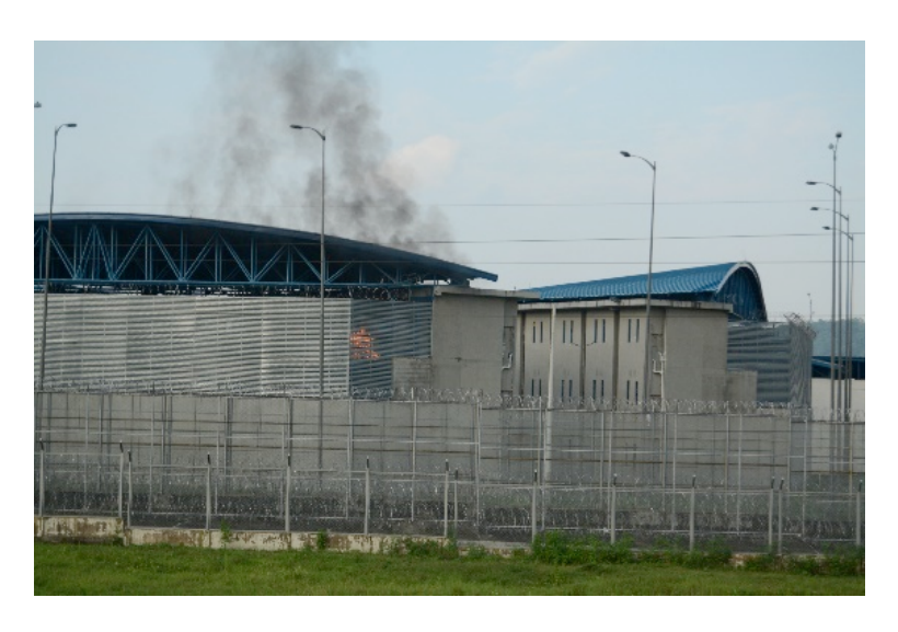
A photo outside of the Regional Prison in Guayaquil

The justice system considered this protest an attempt at mutiny and so 26 prisoners are on trial for arson.