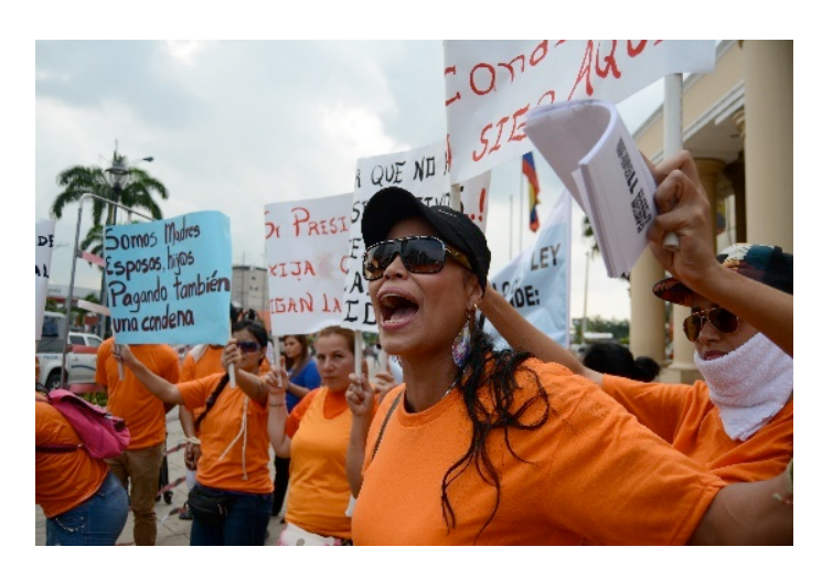
Photo of a protest at the Regional Prison on April 2015 by the Committee of Relatives "United we are more." Guayaquil

Furthermore, on May 11, 2015 the Committee of Relatives of Deprived Liberty formed a protest saying, "We are more together." They held a sit in at the provincial government building and then relocated to outside of The Rock. The thirty women were wearing orange like their incarcerated relatives. Some covered their faces in fear of retaliation for their incarcerated loved ones.