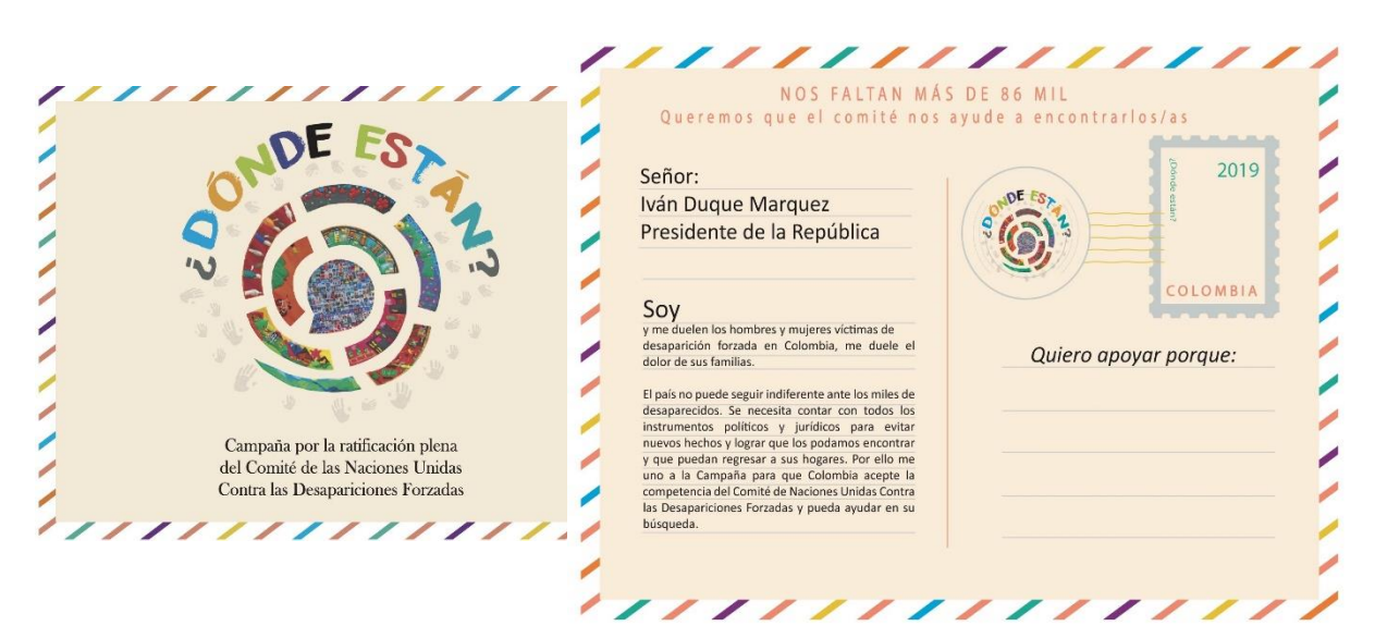
Illustration 2Signature collection postcard

platform<sup>12</sup>. This action has been accompanied by national advocacy actions such as holding forums in universities, virtual discussions, design and dissemination of educational audiovisual material, joint actions with parliamentarians and the filing of different Rights of Petition addressed to the Colombian Government.