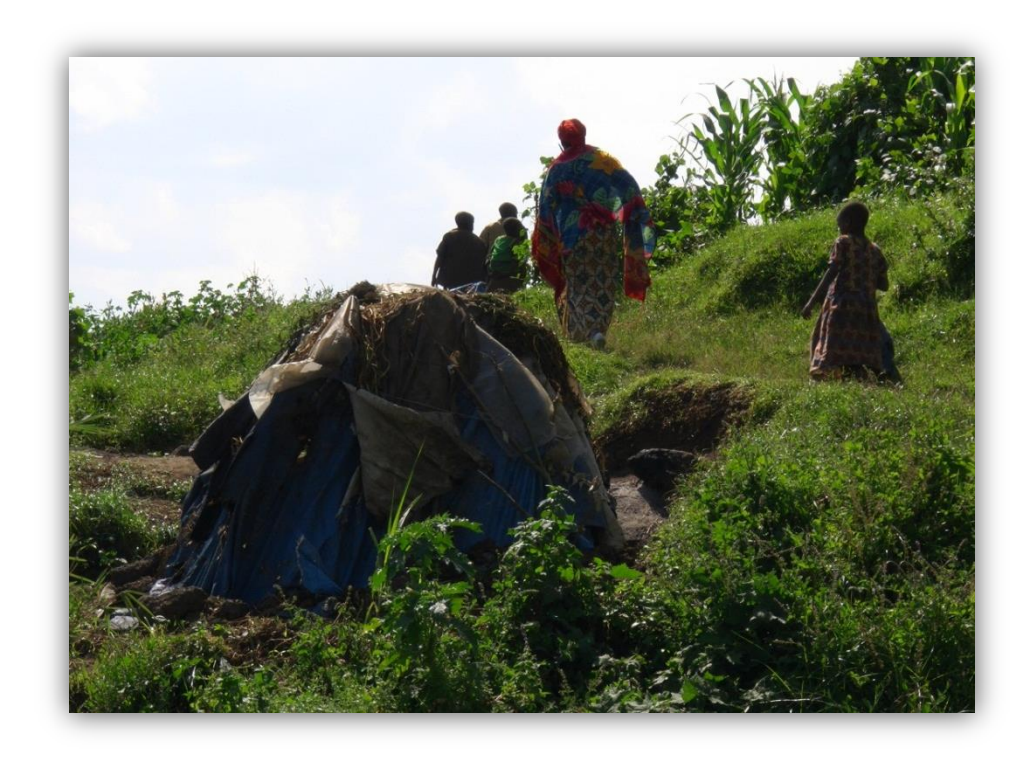
Batwa housing, lower slopes of Muhabura volcano, UNPO field visit, December 4, 2010.