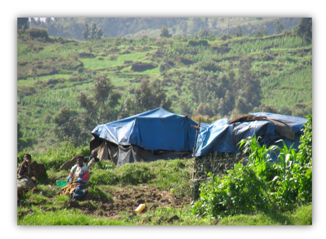
Batwa housing, lower slopes of Muhabura volcano, UNPO field visit, December 4, 2010.

Various government policies have emerged as a result of international pressure and the desire to meet the Millennium Development Goals. However, those have had largely negative impacts on the Batwa, leaving many in worse situations than before and frequently homeless. One example is the "Umudugudu" policy, aimed at relocating people from their rural homes and into villages in order to open up their land for agricultural use and other economic activities and to give them access to infrastructure and better housing. Despite the claims in section 162 of the State report that laws are in place to protect people from forced evictions, many Batwa have been forcefully removed from their homes and their living conditions have not improved after relocation.