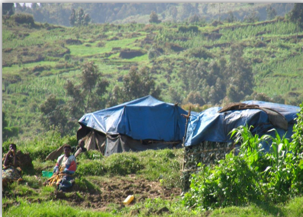
Batwa housing, lower slopes of Muhabura volcano, UNPO field visit, December 4, 2010.

Various government policies have emerged as a result of international pressure and the desire to meet the Millennium Development Goals. However, those have had largely negative impacts on the Batwa, leaving many in worse situations than before and frequently homeless. One example is the “Umudugudu” policy, aimed at relocating people from their rural homes and into villages in order to open up their land for agricultural use and other economic activities and to give them access to infrastructure and better housing. Despite the claims in section 162 of the State report that laws are in place to protect people from forced evictions, many Batwa have been forcefully removed from their homes and their living conditions have not improved after relocation.