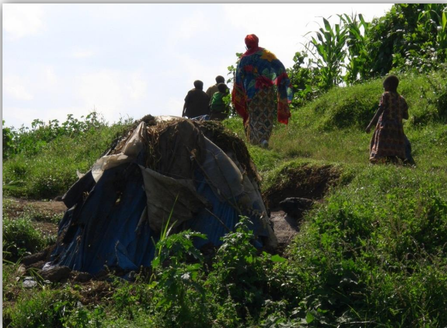
Batwa housing, lower slopes of Muhabura volcano, UNPO field visit, December 4, 2010.