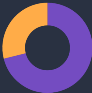
■ No (71%) ■ Yes (29%)

Have you heard of the 'Young Wales' project?