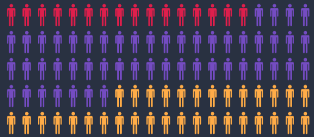
■ Yes (16%) ■ No (51%) ■ Don't Know (33%)

Do you believe you have more opportunities to participate in decision making at a national level since October 2014?