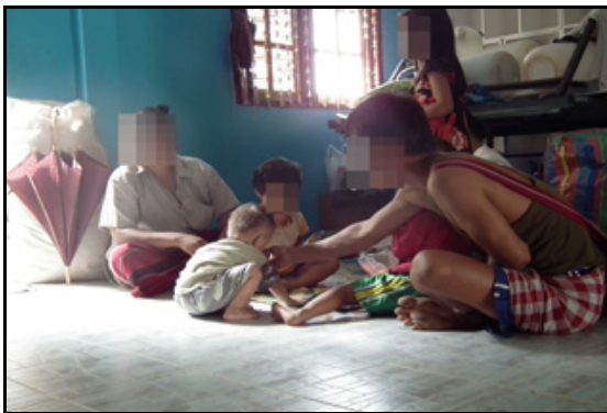
This photo, also taken on November 13 th 2010, shows a family from A--- village at a hiding place in Thailand. They told a KHRG researcher they had fled on November 9 th 2010, but were not going to return because they were afraid that they would be arrested and forced to walk in front of Tatmadaw soldiers during attacks on DKBA or KNLA positions.