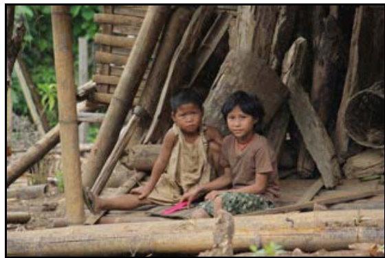
This photo, taken on May 30 th 2010, shows children living in D--- village, Lu Thaw Township, Papun District. These children came to D--- in 2009 when their families fled Tatmadaw attacks in Yeh Mu Bplaw village. Villagers told KHRG that many people try flee to D--- when they have to leave their villages, because their children have good opportunities to continue their education there.