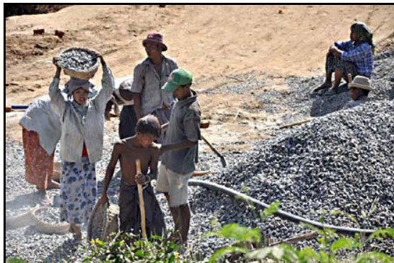
Children earning survival in mining camps, near Myit Kyi Na, Kachin State-December 2010