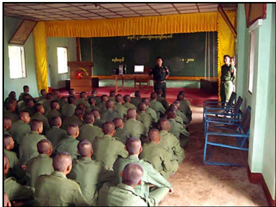
Children among adult army at the military training-at Tha Ton 9- 2008