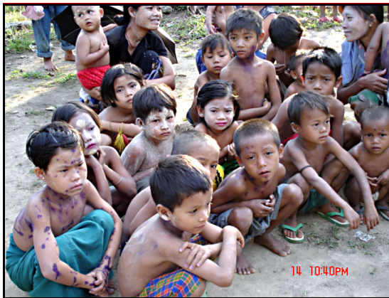
Malnourish children in Mon State-December 2006: Photo by HURFOM