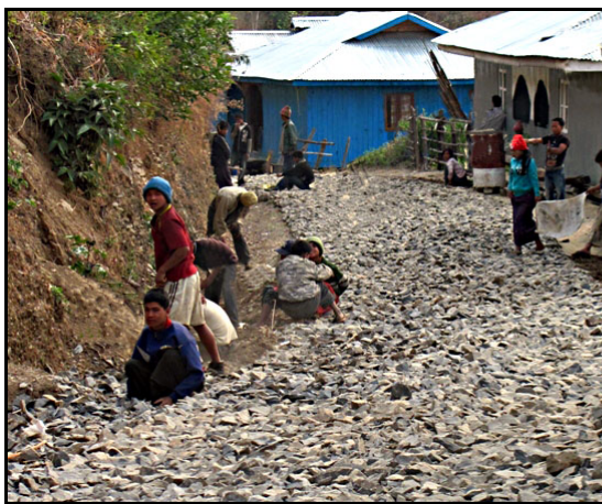
Forced labour at Calthawng village, Rezua, March 2011 township (Matupi-Hakha road)