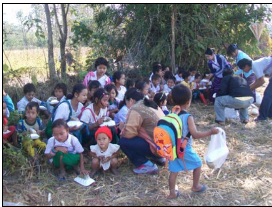
Karen State Cross-border assistance given to three communities in Karen State, Burma by Burmese Migrant Workers Education Committee (BMWEC) 2011