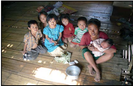
Lack of family planning awareness, food insecurity, lack of basic healthcare are serious burdens for family- Paletwa Township, Chin State- Photo by Khin Tun 2009