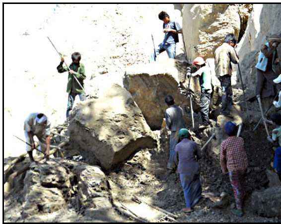
Forced labour on the Matupi - Leisen road, March 2011