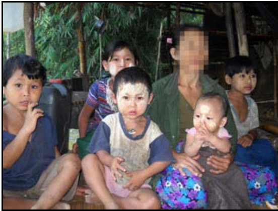
This photo, taken on March 20 th 2010, shows one of the families currently in hiding to avoid Tatmadaw attacks at La--- in Tenasserim Region. Many families in the site reported that they were confronting food shortages; they told KHRG they planned to attempt to buy food in villages in Tatmadaw-controlled areas, but were afraid of what would happen to them if they were captured by Tatmadaw soldiers.