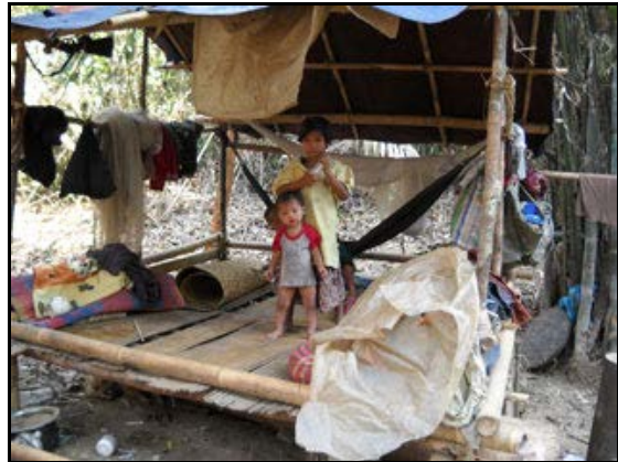
This photo, taken on March 20 th 2010, shows children living in a hiding site in Ht--- village in the Ma Noh Roh area of T'Naw Tha Ree Township, Tenasserim Region. Families in hiding in Ma Noh Roh told KHRG that they fled after soldiers from Tatmadaw IB #17 set up camps in their area in March 2010 and looted villagers' property and animals. Civilians in hiding in Ma Noh Roh have to be ready to flee on short notice because Tatmadaw soldiers are active nearby.