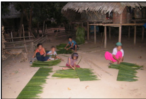
This photo, taken on February 7 th 2010, shows women and children working at night in their village, weaving thatch to meet an order issued by a local DKBA unit in Bu Tho Township. Residents of villages in central Papun District are frequently ordered by local SPDC or DKBA authorities to find, fabricate and deliver thatch and other building materials to their camps.