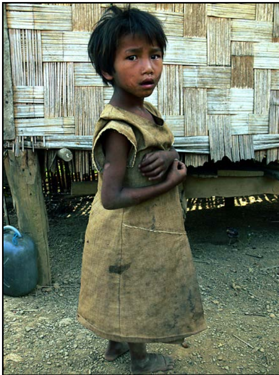
A malnourish child in Paletwa Township, Chin State, Photo by Khin Tun 2009