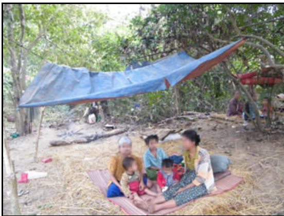
This photo, taken on November 26 th 2009, shows a temporary hiding site in Bu Tho Township, Karen State, established by residents of Pi--- village in neighbouring Dweh Loh Township. Families fled Pi--- after three days of abuse by LIB #219 soldiers. Adults were forced to perform forced labour while children and infants were made to sit in the sun in the camp without food, water, or parental care, in conditions amounting to torture.