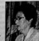
PATRICIA ESPINOSA TORRES, PRESIDENTA DEL INMUJERES.

“ Solicitamos que se lleve la investigación hasta sus últimas consecuencias... (se debe) aclarar si los derechos de las mujeres fueron violentados y si fueron violadas.”