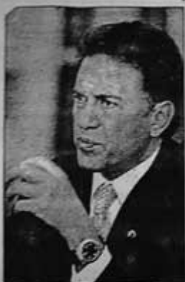
Miguel Ángel Yunes. Imagen de archivo ■ Cristina Rodríguez

La asistencia de Yunes a la Cámara de Diputados servía en esos momentos para responder a la creciente demanda de justicia por los actos de violencia contra los detenidos, y en especial de las mujeres vejadas. La explicación redundó en hacer respetar el multicitado estado de derecho.