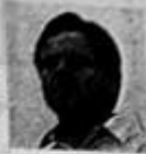
EDUARDO MEDINA MORA, SECRETARIO DE SEGURIDAD PÚBLICA.

“ No se tiene ninguna imputación directa de conductas violentas por parte de los policías federales preventivos que participaron en el operativo para restablecer el orden.”