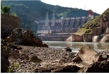
Dam on the Mekong