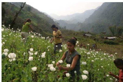
Opium Cultivation in North Laos (Akha)

http://www.worldpolicy.org/blog/2011/10/11/us-funded-rehab-center-abuses-lao-drug-users