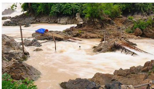
Bridge destroyed by monsum