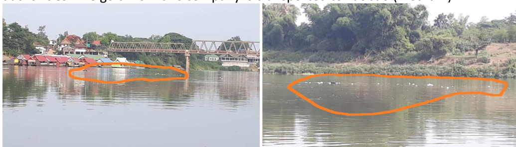
Fish kills in the Nam Ngum River

On May 11, 2018, residents of Thangone District, Xaythany Province reported that Vietnam's garbage disposal factories were dumping wastewater into the Nam Ngum River, resulting in fish mortality. But when the authorities came to see this, the population was forbidden to publish it. The company concerned operates gold mines, among others, which are declared as development projects. The proceeds and profits are not taxed, but compensation is paid to private individuals who work for the authorities. The gold from this company is transported to Laobao (Vietnam).