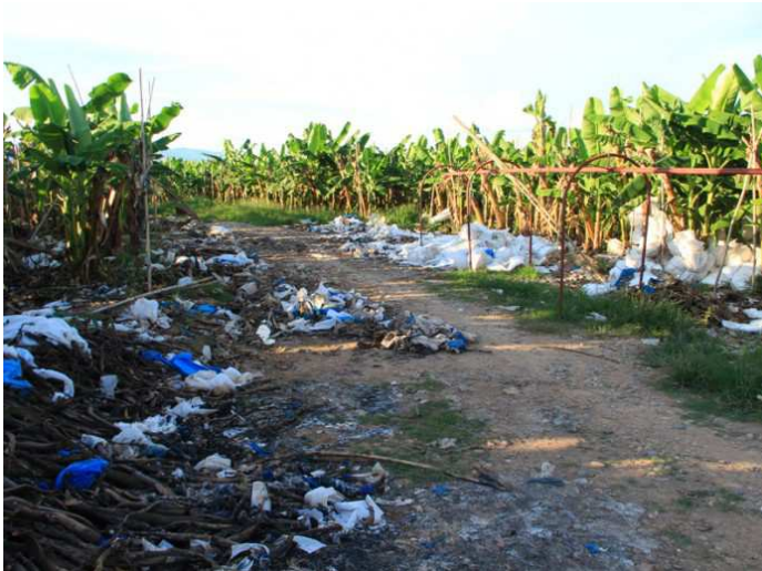
Polluted environment: When growing bananas, a huge amount of plastic waste accumulates.

Pointless large-scale projects such as the construction of a high-speed train which no one can use, by Chinese investors or by the expansion of monocultures in connection with the uninhibited use of pesticides, aggravate the food supply of the population. In addition, there are also national robberies by foreign investors and corrupt officials and a lack of environmental protection in wastewater management and waste management.