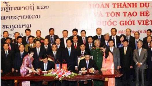
New border agreement between Laos and Vietnam (2016)

Laos has been able to compete in international competition, relying heavily on the help of Vietnam and China. This has led to an ever-increasing dependence. International observers see that the People's Republic of Laos is politically managed by Vietnam and economically by China. Our observers even go so far as to make the locals feel no longer to be lord in their own country. However, a major obstacle to such a partnership is the Vietnamese-Lao Friendship Treaty of 18.07.1977. This secures Vietnam's control over Laos and prevents other states from coming to a better and more intensive partnership. Without the consent of Hanoi, the government of Laos can not act here.