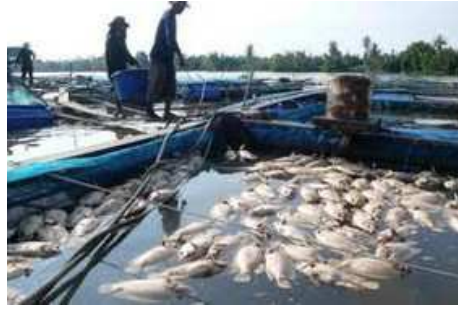
Fish dying on the Mekong

The sustainable use of drinking water is also in danger, due to a lack of sanitation and the uninhibited expansion of the dams. Another danger is the expansion of the monocultures in the country. In recent years, banana plantations, rubber plantations and other monocultures have increasingly supplanted the natural forest and have severely affected the ecosystems in the country.