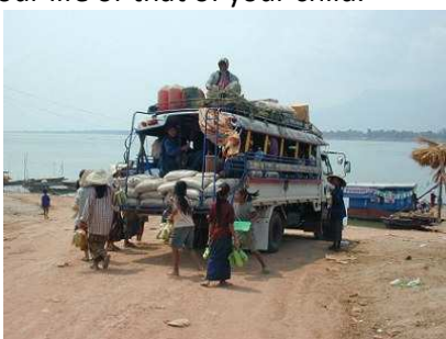
Bus traffic in Laos

During the monsoon season, when the rain falls from May to October, these paths become impassable. Vehicles are no longer coming up the mountains, slipping down the steep slopes, or sticking up to the axles in the mud. The remaining trucks sometimes block the road for days until they are excavated with a hoe and shovel and the sun has dried the lane. Fords are rushing to torrents after a heavy rain and can no longer be crossed; the floods are also tipping over a bus. During the rainy season, for almost half a year, farmers have difficulty getting to the next market or administrative center. The economy is almost paralyzed. Children often cannot go to school; Women who would rather release in the hospital must give birth to their child at home. and take the risk of losing your life or that of your child.