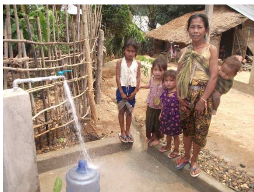
Public fountain in Huephen north of Luang Prabang

Issue: The Lao-PDR has the most water resources in every Asian country per capita, but much of it is uncertain. Drinking water can be contaminated with harmful chemicals and human waste and cause a variety of health problems. UNICEF is working in Laos to ensure that children and families in homes and schools have access to clean water and sanitary facilities.