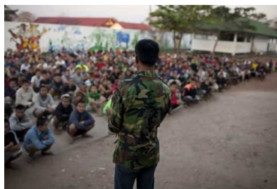
Re-education camp for drug addicts in Vientiane