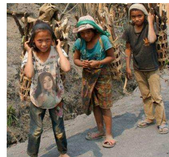
Child poverty in Laos

The "Lao Revolutionary People's Party" sees itself as a Marxist-Leninist party, which - according to the constitution - has an absolute leadership monopoly. In fact, only in easily accessible areas is it able to exercise this claim to leadership. In many of the remote regions, political loyalties are characterized by ethnic or clan structures. The political system is barely able to develop a binding force because it does little: Public goods such as health care, education and training, secured land use rights and efficient administration are only inadequately provided. Patronage networks play a much greater role than the formal organizational structures of a Leninist party. Laos is ranked 135th out of a total of 178 countries in the Transparency International Corruption Index. (Source: Stiftung Wissenschaft und Politik, Gerhard Will)