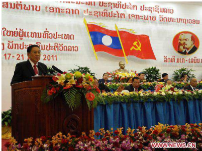
Communist Party Congress from Laos and Vietnam (2011)

Issue: Laos has taken two correct steps in the right direction with its entry into the ASEAN Alliance and its accession to the WTO. Likewise, the liberalization of the economy since 1987 has been an important milestone for a more sustainable development. However, corruption and lack of implementation of international standards and also its own laws inhibit the development in the country massively.