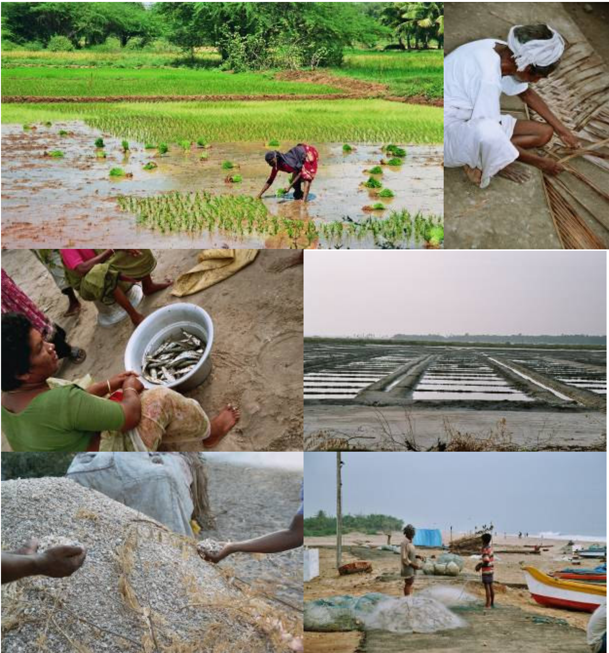
Figure 1: Different forms of Dalit labour in the Tamil Nadu coastal region: rice paddy labour, thatch-making, salt-pan harvesting, net-mending, shell collection and fish-vending (clockwise from top left)

the boats in the sea, but they are strictly forbidden from owning the boats. Dalits may own small boats on inland waters, but not on the sea itself. Caste fishermen claim a customary right to control sea fishing. Though they are rightly considered a vulnerable community, within their own domain, their power is supreme, and government officials, police and elected leaders do not dare interfere with their decisions at the local level. Most coastal Dalits are afraid of the caste fishermen, who have numerical, financial, class and caste superiority over their Dalit neighbours. They would not risk the violence that may be unleashed if they were to go against the wishes of the caste fishermen. Questions posed as to ‘what would happen if Dalits started doing sea-fishing in their own vessels?’ were met with the nervous laughter that greets a naïve question that should never be verbalised. As a human rights lawyer based in Cuddalore explained: