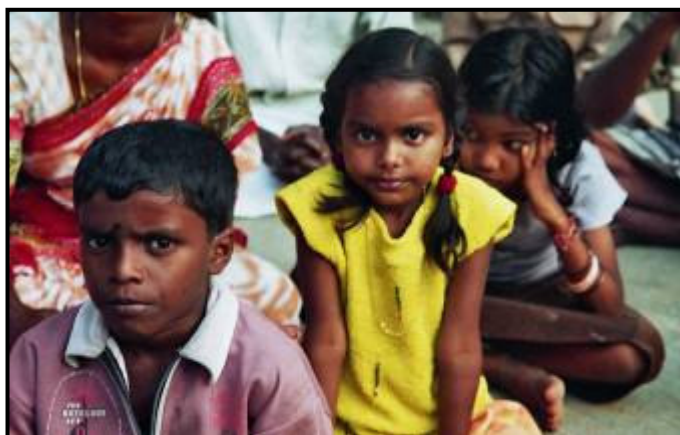
Figure 9: Dalit children from the village of Nonankuppam, Pondicherry, January 2005. Their families – who do backwater fishing for a living – were denied the government relief package provided to the Meenavars living in same village who are doing exactly the same work in the same place.

Additionally, it seems that the Pondicherry Union Territory government (separate to the Tamil Nadu state government) took a general policy to not give any package to Dalits (information from local