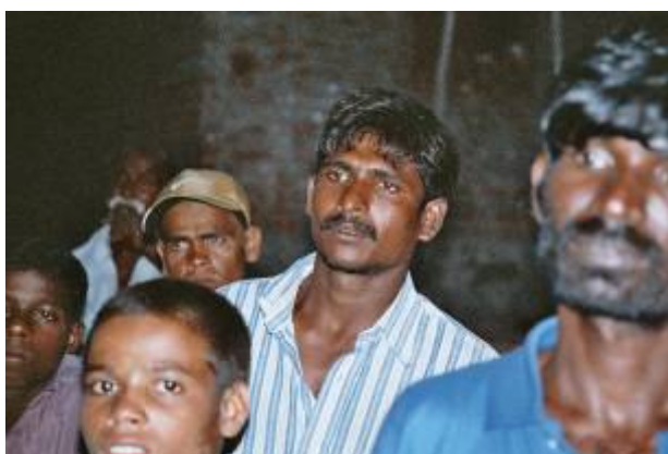
Figure 3: Dalit man (striped shirt) forced to abandon use of his new kattamuram due to debt bondage to Fernandos. Singithurai, Thoothukoodi, October, 2005.

Denial of services and employment is a strategy used by dominant castes to prevent Dalits from advancement. This suppression technique is still being used today in Tamil Nadu's coastal belt (and many other parts of rural India). Prevented from buying food, using toilets, making telephone calls, finding work, letting animals graze or accessing water supplies, Dalits are forced to give up claims to