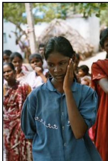
Figure 8: Dalit girl from the highly affected Raja Nagar village, Chengalpat, shamed in front of her schoolmates for receiving school supplies and forced to return them. October 2005.

Though they may have helped Dalits in some areas, this study showed that even these schemes often proved to be the basis for discrimination on the basis of caste. Dalits were denied access to UNICEF water; Dalit children were forced to pay for UNICEF school-bags provided free of charge to others. Dalit children were charged school fees and were denied books, shoes, bags or pencils. In Dr. Ambedkar Nagar, Pulicat, for example, People's Watch Tamilnadu identified 68 Dalits children who were denied notebooks and other materials that they should have received 50 .