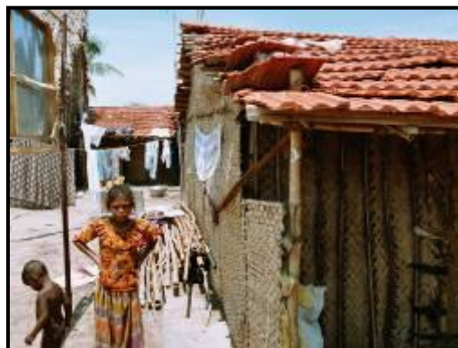
Figure 5: Vaira Maligai temporary shelter, with a vast majority of inhabitants Dalits and Adivasi. The roofing has warped and the mud washed away from the thatch so that the rain pours straight in and floods the shelters. September 2005

I went to the place where an NGO was giving out kitchen utensils and other relief supplies. As I had been swept away by the tsunami when it reached the backwaters and had lost everything in my house, I felt it was my right to receive those things too. However, after I received it, the Meenavars took it from me. The NGO people saw this, and replaced what was taken from me, but as soon as they were out of sight, the Meenavars came and took it from me again.