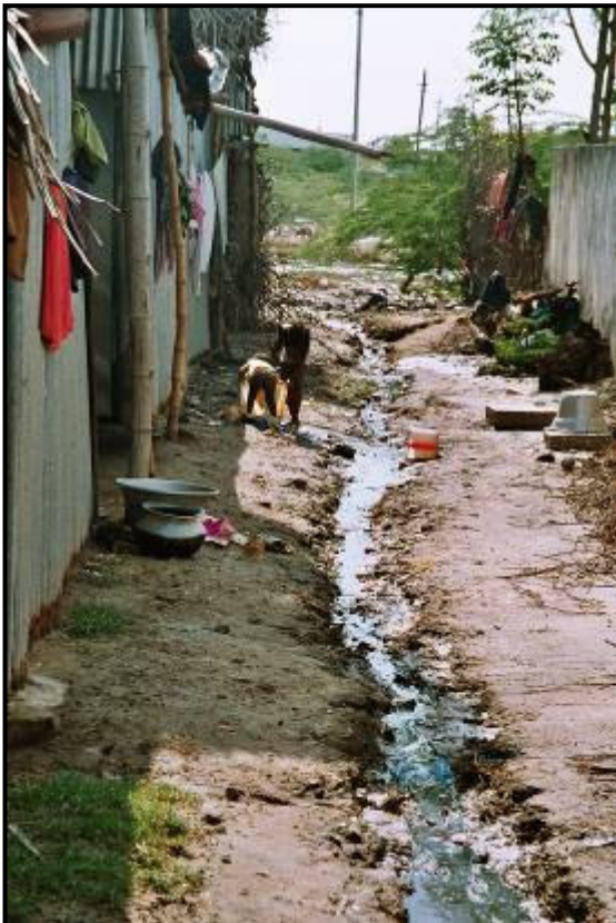
Figure 7: Sewerage runs past the Dalit section of Pandagasalai temporary shelter, Nagapattinam, September 2005

The relief camps, whose establishment was controlled by the government, were entirely inadequate for the amount of time it took to find land for permanent accommodation. Dalits were indeed segregated from caste fishermen, either in their own separate shelter, or in a separate section of a mixed shelter. While the general standard was poor, it can be seen that the camps where Dalits stayed were given less priority than others. The story of Kannigi Nagar (see Case Study 5) is a prime example, but other examples are provided by the lesser treatment of the Dalit community in the Nagapattinam temporary shelters 'Sivankoil' and 'Vaira Maligai' and by the fact that the Dalit section in the appalling 'Pandagasalai' camp was placed alongside the open sewerage/wastewater drain (see photo). In Sivankoil temporary shelter (see Case Study 6), the Dalit community saw a clear difference in treatment compared to shelters occupied by caste fishermen: