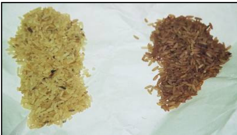
Figure 6: Under the supervision of Government officials, the rice on the left was given to members of higher castes; the rice on the right, which is rotten, was given to affected Dalits.

The Prime Minister of India reported with pride that a plane was airborne within one hour of the news