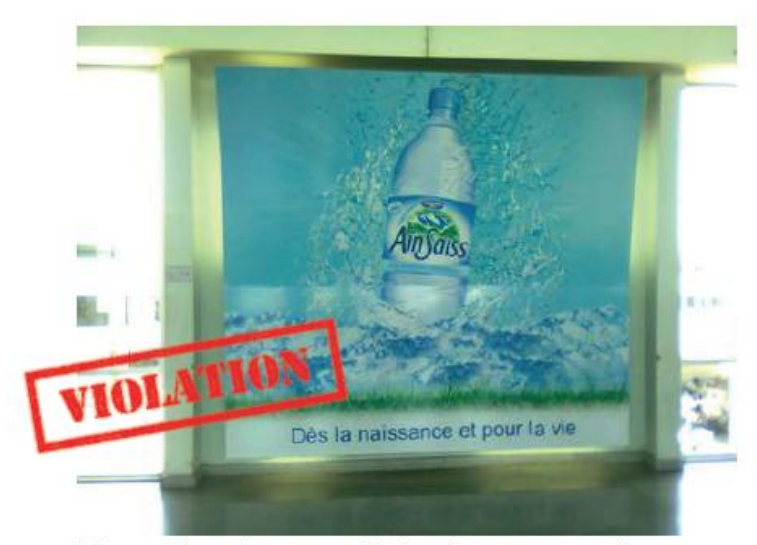
Taking off in a big way; well placed promotion in heavy traffic areas such as airports.

■ In Morocco, a larger than life poster at the Casablanca airport promotes Ain Saiss mineral water with the slogan "From birth and for life".