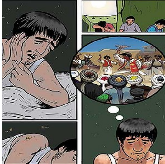
Graphic courtesy Department of Customs and Border Protection, February 2014.