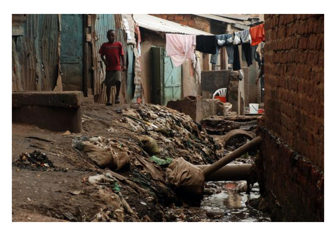
State of sanitation in Katanga, a Kampala slum

was the case in 2005. This shows discriminatory approaches which concentrate on improving access for urban populations while the rural are marginalised.