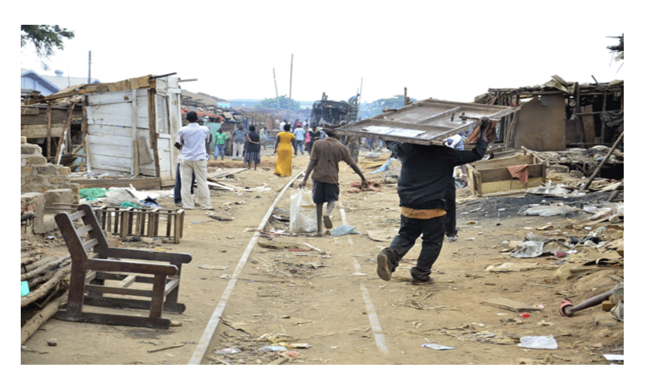
People collect some of their property after their homes were demolished by KCCA. Photo by Dominc Bukenya, Daily Monitor Newspaper , 6<sup>th</sup> August 2014.