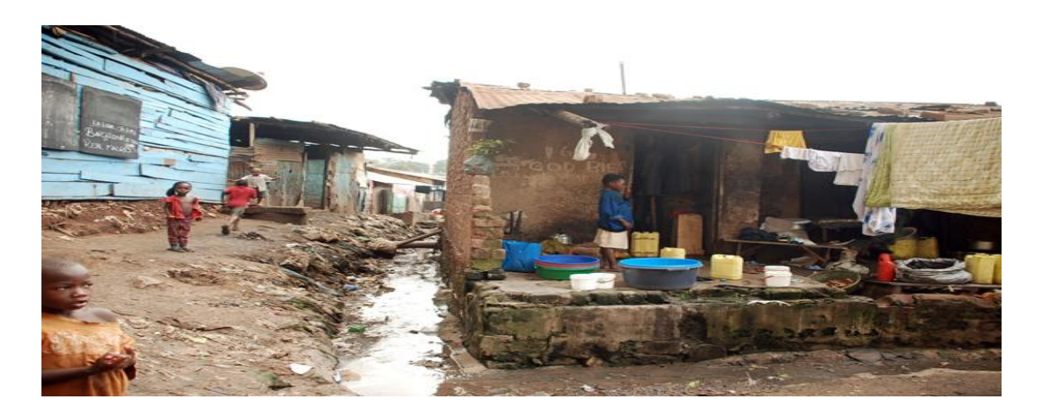
State of Housing at Katanga, a Kampala Slum

9.8. Official government data also indicates that the emerging rapid increase in the urban population is not being matched with growth and development in basic physical infrastructure, housing, social amenities, management and skills. This has led to overcrowding, growth of slums and informal settlements, dilapidated housing and poor sanitation.<sup>74</sup> One of the factors responsible for this is the absence of a comprehensive urban policy to guide the urbanization process, ensure orderly development and enhance urban management.<sup>75</sup> Additionally, in line with the government's World Bank and IMF driven policy of privatisation, development of housing estates has largely been left to the private sector, which has made houses economically inaccessible to the urban poor, yet the private sector does not adequately invest in infrastructure.