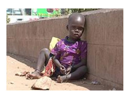
A child on the streets of Kampala

8.3. Government has not adopted a systematic programme to remove children from the streets, rehabilitate them and re-integrate them into family environments. Occasionally, the children in Kampala, the capital city, are rounded up in a bid to "clean up" the city, yet a few days later the streets will be full of children. The majority of these children come from the Karamoja region of North Eastern Uganda, pushed by the insecurity, famine and lack of services in the region. Government has failed in this regard mainly because it has not taken deliberate and comprehensive steps to address the factors that push children to the streets. There is an urgent need to improve the security and socio-economic situation in Karamoja and to put in place measures to monitor the movement of children, who are usually trafficked to Kampala.