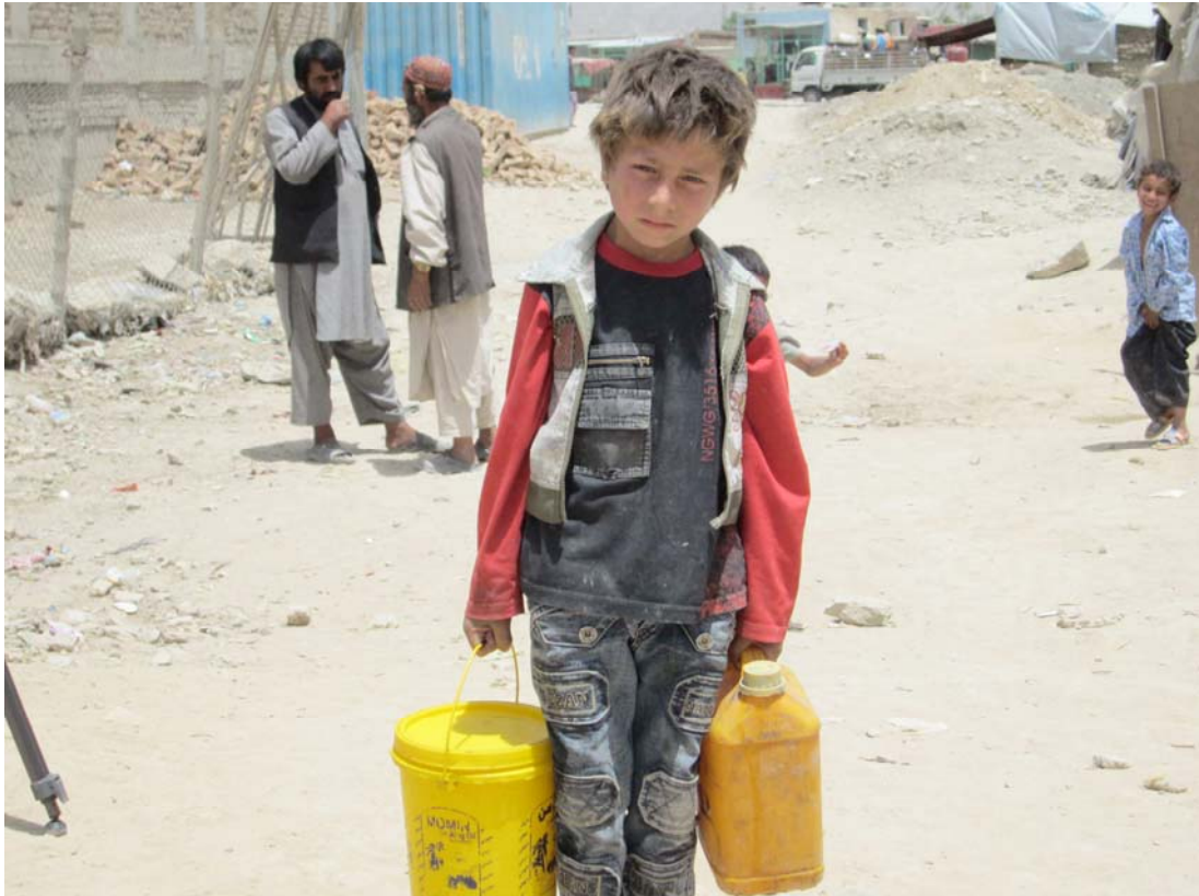
A young boy, about six or seven years old and living in the Chaman-e-Babrak settlement of Kabul, returns home with water on one of half a dozen trips he makes each day.

In addition, as UN-Habitat indicators note, access to safe water requires that households should not have to spend an undue proportion of income or time to acquire it. 101 The World Health Organization has estimated that when water access is basic, requiring a walk of up to one kilometre or within 30 minutes roundtrip, families are unlikely to be able to collect more than 20 litres per person daily, resulting in high public health risk from poor hygiene. When water collection requires a walk of more than one kilometre or more than 30 minutes roundtrip, families are unlikely to be collect more than five litres per person each day, hygiene practice is compromised, and basic consumption needs are not met; the World Health Organization classifies such conditions as “no access” to water. 102 With regard to cost, the UN Committee on Economic, Social and Cultural Rights has noted that “water, and water facilities and services, must be affordable for all. The direct and indirect costs and charges associated with securing water must be affordable and must not compromise or threaten the realization of other Covenant rights.” 103