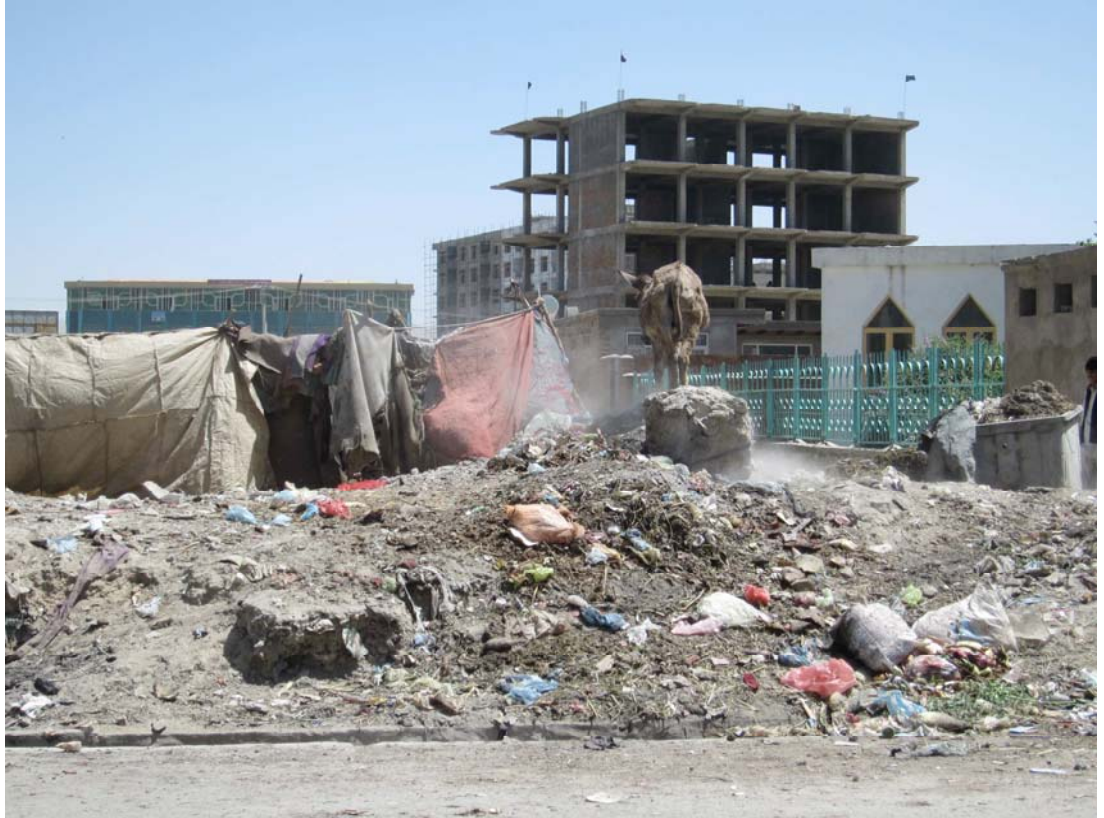
The residents of Kart-e-Parwan, in Kabul, have occupied an abandoned lot that doubles as a garbage dump.