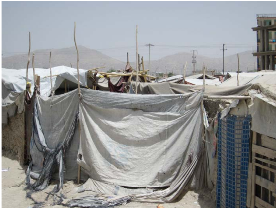
Some shelters are little more than scraps of canvas draped over wooden poles, as with this dwelling in Kart-e-Parwan, Kabul, photographed in June 2011.

As discussed earlier in this chapter, the conflict is a far more immediate and pressing reason for families to uproot themselves, particularly as the fighting spreads and intensifies. And as the rest of this report demonstrates, life in these urban slums is one of unrelenting misery, where even the basic requirements of life are barely met, belying the assumption that people stay there out of choice.