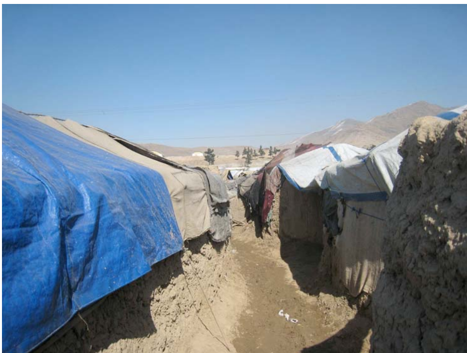
Internally displaced families living in slum areas such as Charahi Qamber, pictured, construct makeshift dwellings on abandoned lots from mud, poles, plastic sheeting, and whatever other materials they can find.

“The trend clearly indicates that displacement is on the rise,” as a 2010 report by the Brookings-Bern Project on Internal Displacement observed. 12 Over 57,000 people were displaced from their homes because of the conflict in the first three months of 2011, an increase of 41 percent over the last quarter of 2010. 13 Looking at the first six months of each year, the increase in displacement was even greater—the total of 91,000 people displaced between January and June 2011 was 46 percent more than the 42,000 displaced in the first half of 2010. 14