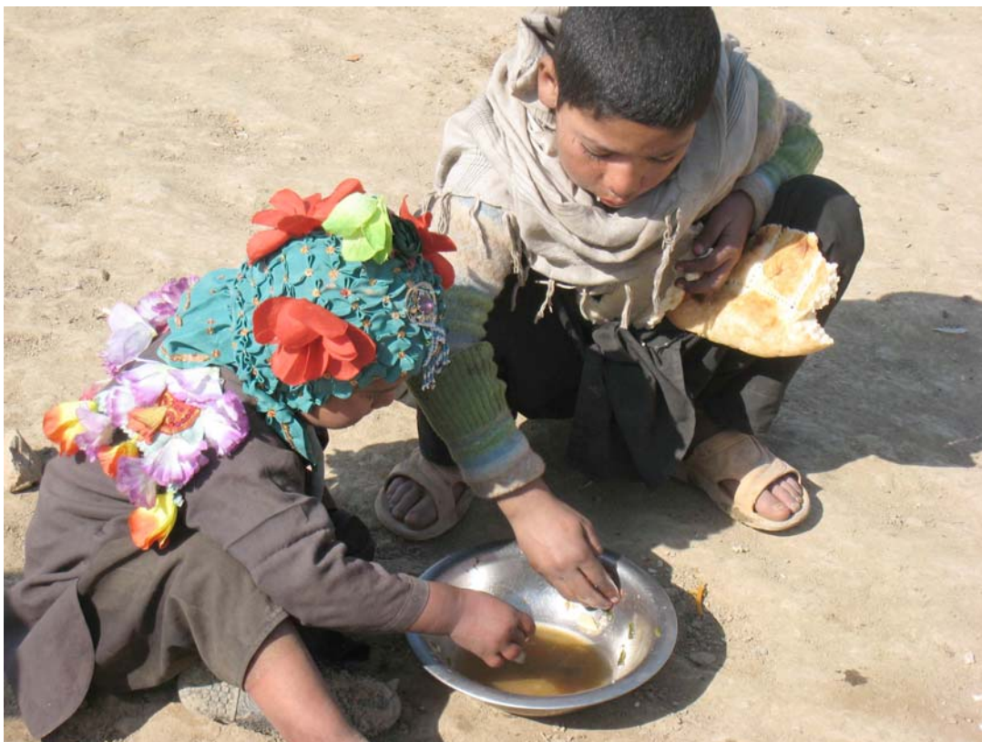
Two children in Charahi Qamber, in the west of Kabul, share a bowl of food provided by a local aid organisation. Many displaced families routinely go hungry.