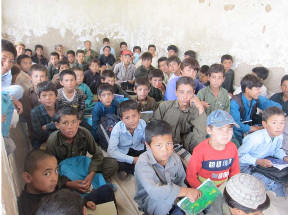
Children crowd into a classroom in Maslakh camp, on the outskirts of Herat.