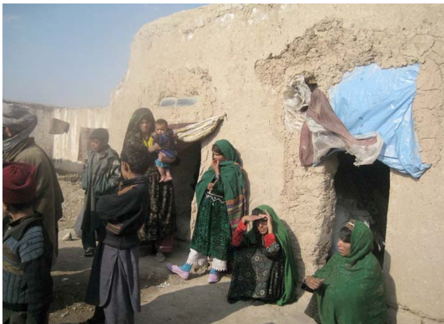
A family displaced from Badghis province has sought refuge in Herat's Maslakh camp.

Those who are displaced internally face periods of displacement that are likely to be longer than they have been in the past and a likely increase in secondary displacement to urban areas. As the Afghanistan Protection Cluster observed for the southern area: