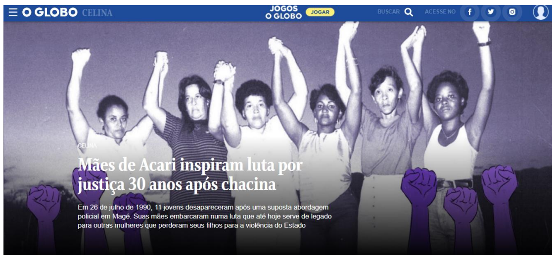
( Mães de Acari inspiram luta por justiça 30 anos após chacina - Jornal O Globo - 2020)