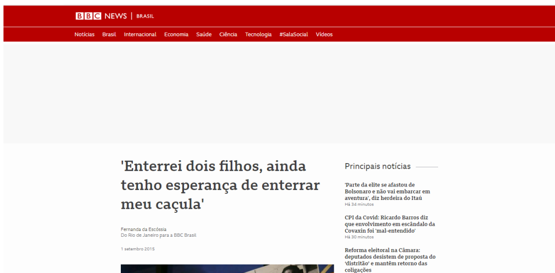
( 'Enterrei dois filhos, ainda tenho esperança de enterrar meu caçula' - BBC News Brasil -2015)