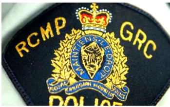
RCMP say a teen is in custody and two others were sent to hospital following an alleged assault at a Surrey

CBC News - Posted: Feb 22, 2022 5:18 PM PT | Last Updated: February 23