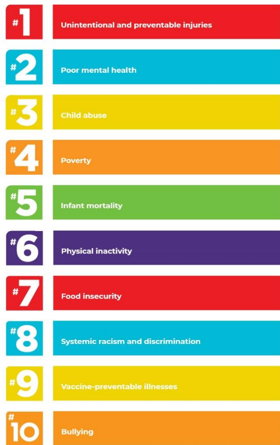
1: Top 10 Threats to Childhood in Canada (Raising Canada 2020)

Children First Canada has since held a special session of the Young Canadians' Parliament, in which children and youth had the opportunity to discuss the top 10 threats and bring forward their recommendations to Members of Parliament and the Senate, and we have held two special events with