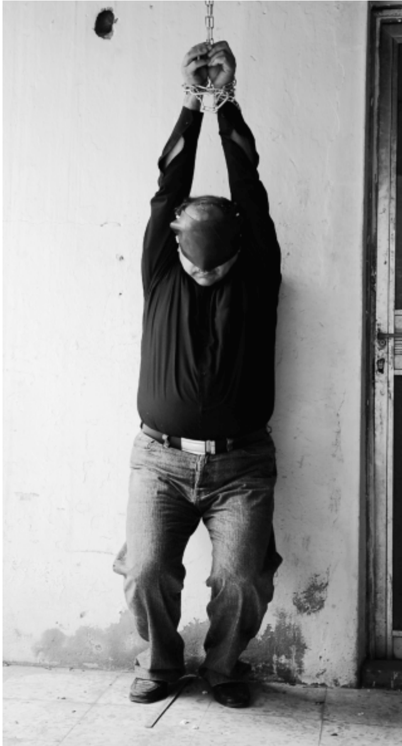
24 HOURS HANGING