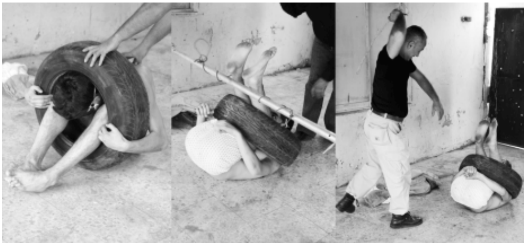
TIRE / WHEEL