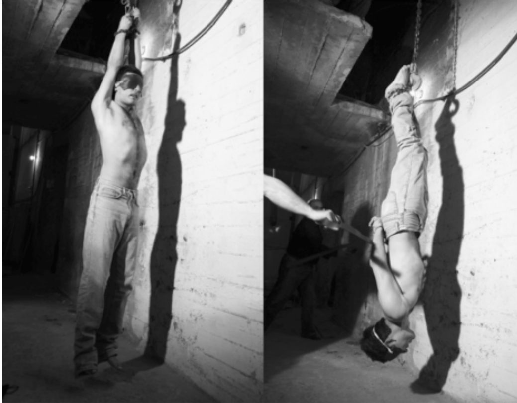
HANGING UPSIDE DOWN