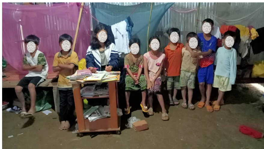
Picture of the children in the makeshift house

In December 2021, BPSOS sent a shadow report, Consequences of Statelessness on Hmong Christians: The Children of Subdivision 181 in Vietnam – a Case Study , to the Committee on the Rights of the Child (CRC) 9 . This document described the failure of the local government to resolve the statelessness of this Hmong Christian community, focusing on the barriers to education caused by statelessness. The government had not built a school for this community's undocumented children who must live by themselves during the school week in shacks far from home but closer to the schools they attend. The makeshift classrooms built by their parents, in the hope of eventually getting teachers to come to their village, were ordered to be demolished by the government.