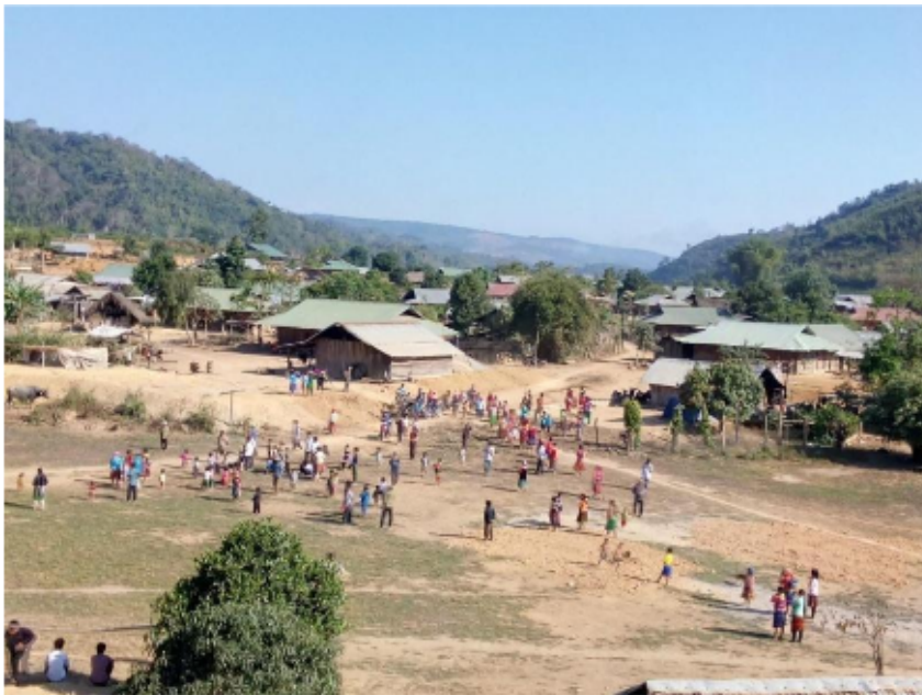
A section of Area 179, Liên Srôn̄h Commune, Đam Rông District, Lâm Đôn̄g Province

In many remote areas in northern provinces, Hmong Christians fare even worse because both the government and villagers jointly force them to abandon Christianity. Those who refused to do so were banished from their communities without any legal basis. Several victims asked BPSOS to submit their cases to the United Nations are members of the Evangelical Church of Vietnam (ECVN) - North, a major government-controlled Protestant organization in northern Vietnam, because their church did not speak out on their behalf.