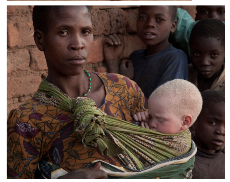
A mother and her child with albinism in Tanzania