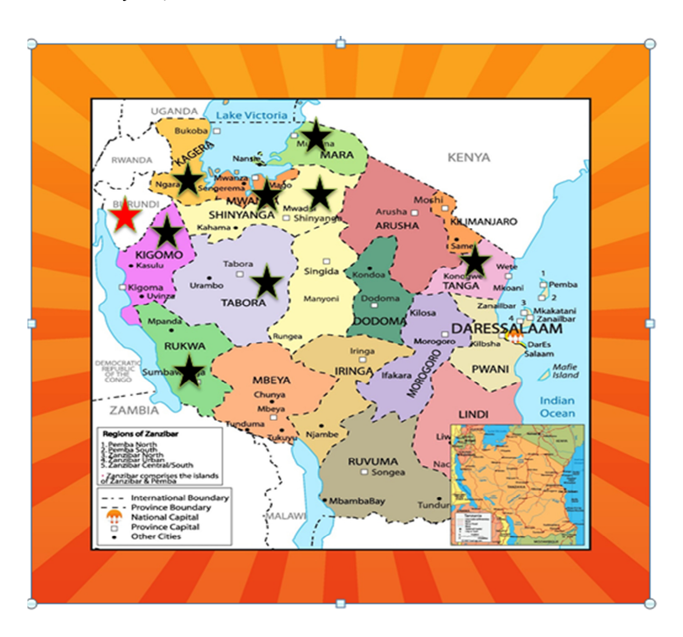
Image 3: Location of known centres holding displaced children with albinism in Tanzania as of 2014 (indicated with black stars).