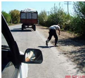
These pictures where taken on a Sunday during the harvest when a school-age boy trying to escape from the cotton fields hitched a ride on the back of a tractor pulling a load of cotton. The boy lost his grip and fell from the vehicle at a high speed and was nearly run over by a passing car. The incident shows the level of care teachers and law enforcement officers put into the children's security. Khorezm province, 2009.

Uzbekistan is full of agencies whose stated purpose is to oversee the labour market and insure child and family rights are protected. There are labour inspection agencies, union organizations in every district, family and child protection bodies and regional commissions for the affairs of minors. But no one denounces the use of child labour while violations of children's rights continue unhindered.