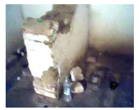
Pictures taken by children using cell phones during the 2009 cotton harvest in the Namangan region. From left to right: bread the schoolchildren were fed; sleeping quarters; toilets.

Association staff who conducted photo and video filming in the cotton fields for approximately one-and-a-half hours per day suffering from headaches. Schoolchildren picking cotton complained of headaches too. In some cases children developed allergic reactions. Likely these symptoms are the result of overuse of chemical defoliants ahead of the harvest. The levels of pesticides and herbicides in the air far exceed permissible norms. In some districts children picked cotton using gauze bandages instead of respirators.