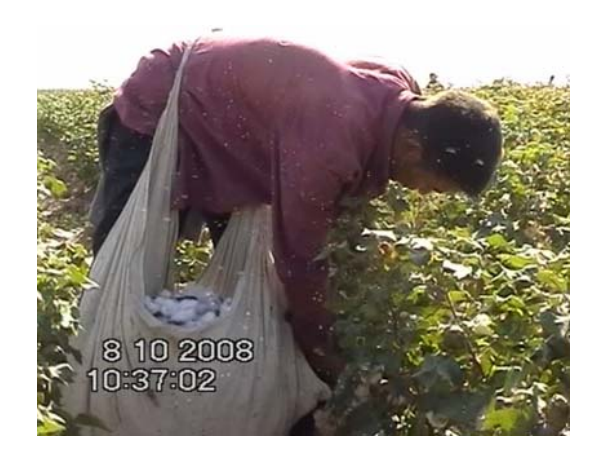
Gnats and low plants make work especially difficult for the child cotton pickers. Kashkadarya province, 2008

From September 1 to November 15, 2008, the Association of Human Rights in Central Asia documented incidents of the use of forced child labour in cotton harvesting in the Kashkadarya, Bukhara, Syrdaryo, Namangan, Ferghana and Khorezm provinces of Uzbekistan.