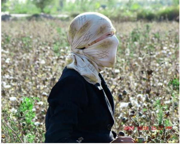
Cotton harvesting in fields treated with chemicals. Karakalpakstan, 2009.

Health and safety rules are not adhered to when children are transported, the Association found. For example, in Misken village of Karakalpakstan, 11 to 13 year old children were driven from a field in a dump truck. "They were crammed standing up in the truck like sardines," one witness testified.