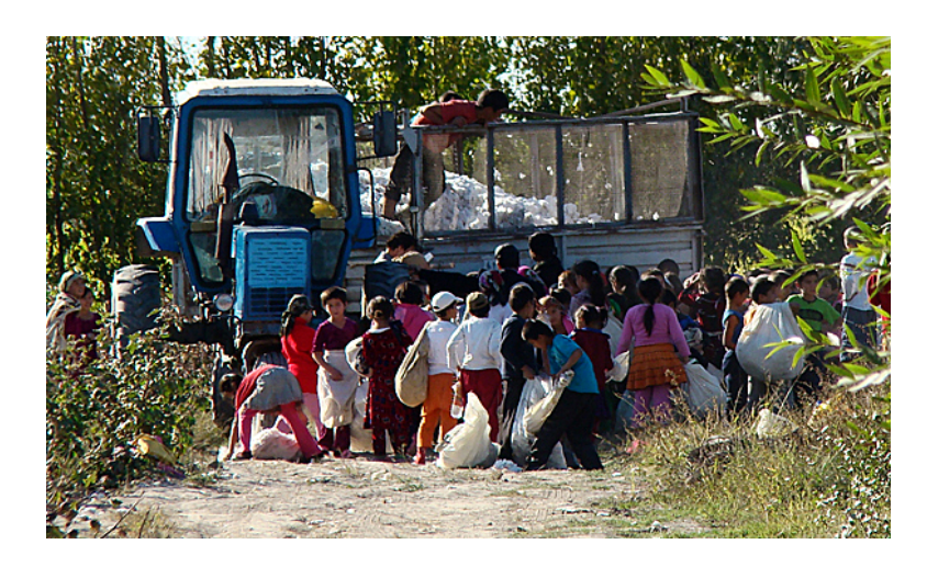
10 to 12-year-old children deliver cotton to a farmer. Khorezm province, 2009.

by the Association of Human Rights in Central Asia, a mass mobilization of children across Uzbekistan was started on September 22. We documented schoolchildren aged 13 to 15 picking cotton in the Jizzakh, Andijan, Syrdaryo, as well as Khorezm provinces on that day. However, children were also known to be picking cotton in the Ferghana valley and Kashkadarya province in 2009. We also have photographs showing children aged 12 to 14 picking cotton in areas near the Aral Sea that year.