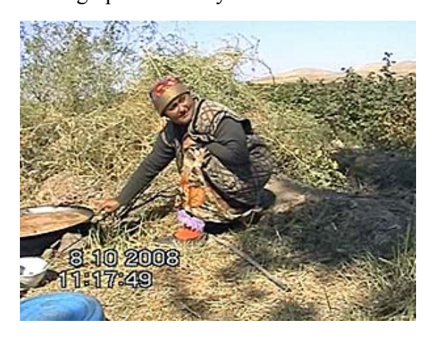
A cotton harvester prepares a meal during a break from work. Kashkadarya province, 2008

The Association documented a group of 12 to 14-year-old students of the Number 23 Alisher Navoi school in the Kitab district of Kashkadarya province picking cotton. Photographs taken by Association staff show that many of the children were only slightly