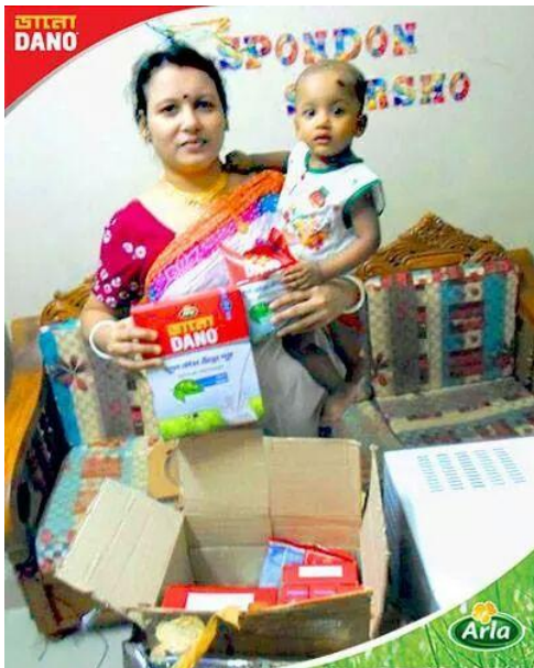
Mother receiving gift package at home from Breastmilk Substitutes Company (Arla - Dano)

Article 5.5 of the Code prohibits marketing personnel from seeking direct or indirect contact with pregnant women and mothers.