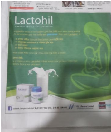
Advertisement of Breastmilk Substitutes in the Daily Prothom Alo newspaper