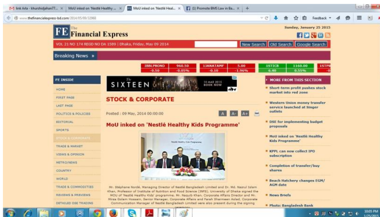
Memorandum of Understanding inked on Nestlé Healthy Kids Programme

Article 6.2 bans the promotion of products within the health care system. Article 6.3 prohibits the display or the distribution of company materials unless requested or approved by the government. Article 7.3 provides that there should be no financial or material inducement to health workers to promote products. WHA resolutions 58.32 [2005] and WHA 65.60 [2012] calls on countries to ensure that financial support and other incentives for programmes and health workers do not create conflicts of interest.