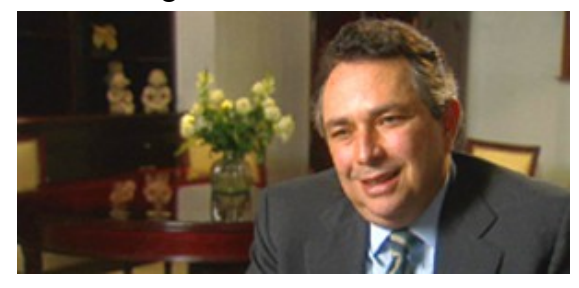
'Mexico's most wanted man', Carlos Cabal in 2003

that locking the men in a wire cage with floor area only big enough for a chair constituted a breach of prisoners' right to humane and dignified treatment. The men were extradited before the HRC reached its Final Views. Australia has said it would ensure 'a similar situation does not arise again', but does not accept that Cabal and Pasini are entitled to compensation.