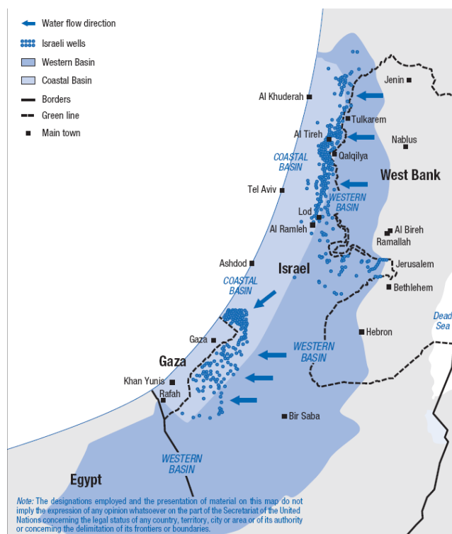
Map by Sustainable Management of the West Bank and Gaza Aquifers (SUSMAQ) project, funded by DFID and in collaboration with University of Newcastle upon Tyne and the British Geological Survey (2001–2004). Published in UNDP, Human Development Report 2006: Beyond Scarcity: Power, poverty and the global water crisis (New York: UNDP, 2006), p. 217, at: http://hdr.undp.org/sites/default/files/reports/267/hdr06-complete.pdf .

People living in the oPt have access to 320 cubic meters of water annually, one of the lowest levels of water availability in the urbanized world and well below the threshold for absolute scarcity. The unequal distribution of water from aquifers shared with Israel reflect the initial destruction