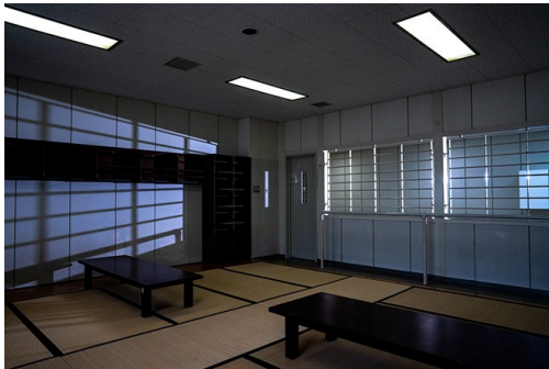
Inside the Omura Immigration Center in Omura, Nagasaki Prefecture, in July 2019