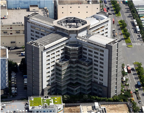
The Tokyo Regional Immigration Bureau

Two foreign female detainees have filed a lawsuit with Tokyo District Court seeking temporary release from an immigration facility because of fears of infection by the novel coronavirus.