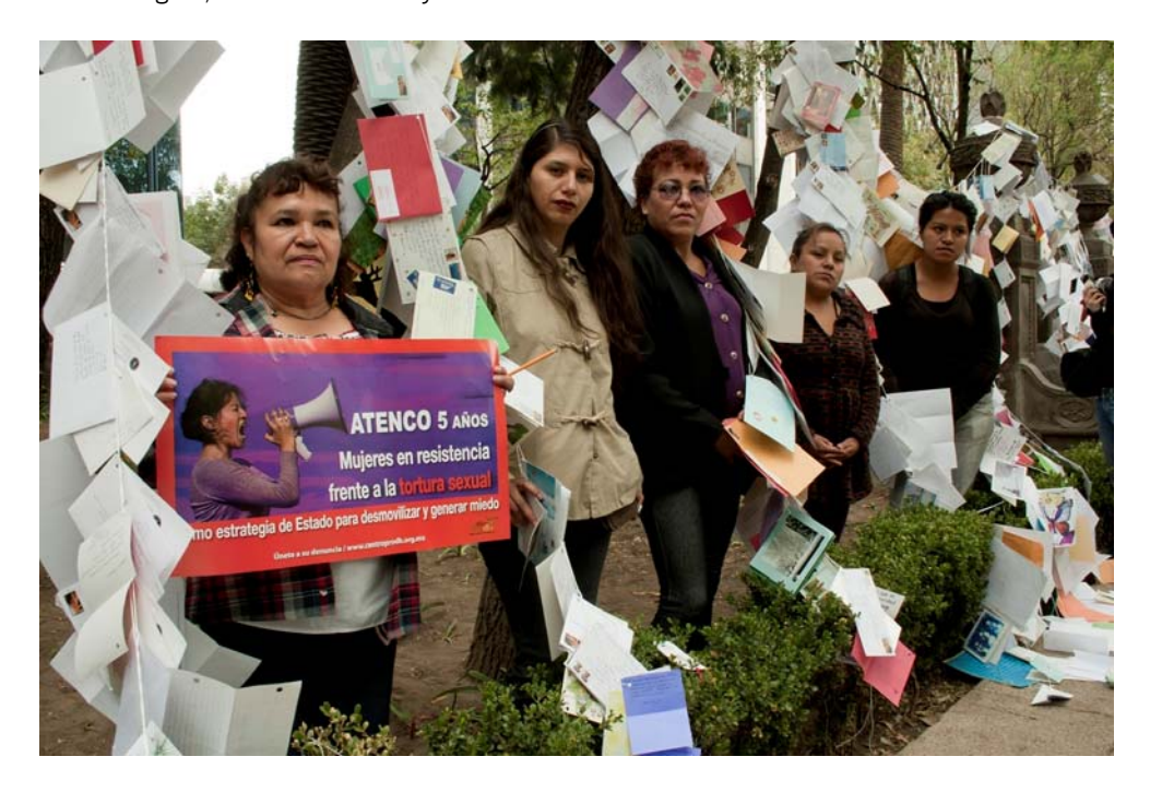
The women of Atenco demanding justice during a demonstration

The National Human Rights Commission (Comisión Nacional de Derechos Humanos,CNDH) and National Supreme Court of Justice (Suprema Corte de Justicia de la Nación, SCJN) both carried out enquiries and concluded that grave human rights violations had been committed, including discrimination and torture involving sexual violence against women detainees, and issued recommendations for perpetrators to be brought to justice and victims to receive reparations. Nevertheless, state and federal authorities have failed to comply despite accepting the recommendations in principle. Neither the CNDH nor the SCJN carried out an evaluation of compliance. In the face of this evident failure to ensure access to justice for victims, eleven of the women have taken their case to the Inter American Commission of Human Rights, which has formally admitted the case.