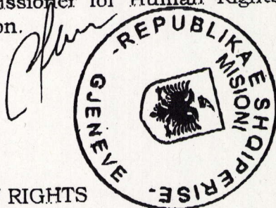
Ambassador Sejdi Qerimaj

The Permanent Mission of the Republic of Albania to the United Nations and other International Organizations in Geneva avails itself of this opportunity to renew to the Office of High Commissioner for Human Rights in Geneva the assurances of its highest consideration.