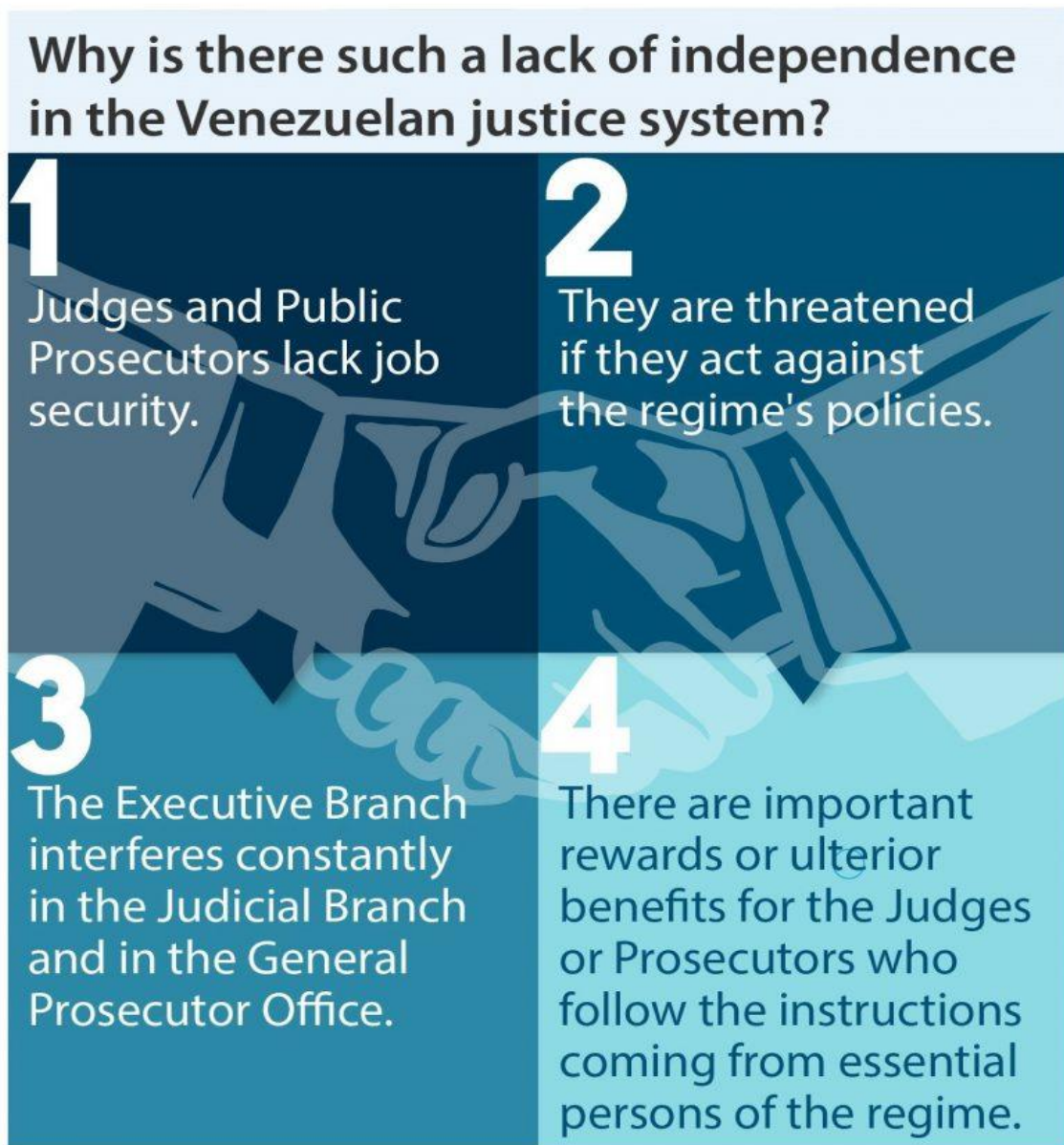
Figure 3 91