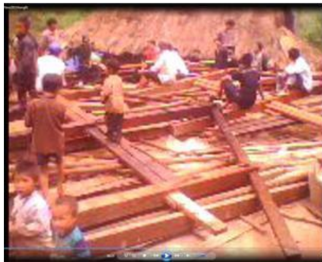
What left of the H'Mong Protestants' homes in Xa Na Khua Village, Jan 28, 2011

All residents of Na Khua Village decided to come together to pray and plead with the government to change its policy. Words got out to H'Mong communities in other provinces who had been similarly driven into statelessness. On May 1, 2011 thousands H'Mong adults and children gathered at a location near Huoi Khon Village in Muong Nhe District, with some coming from as far as Dak Lak Province in the Central Highlands and Binh Phuoc Province in the South.