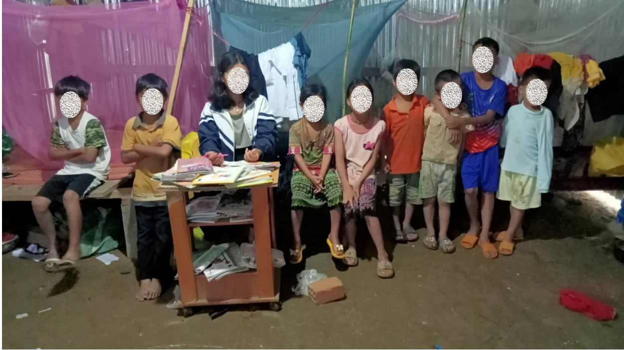
Picture of the children in the makeshift house

In the Concluding Observations of its 2022 review of Vietnam, the CRC Committee raised concern about the impact of statelessness on H'mong and other ethnic children: