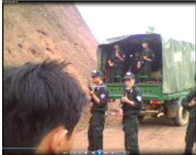
Troops, armed with weapons and live ammunition, encircling the demonstrators, May 4, 2011.

The military troops and the police arrested many demonstrators and took them into custody. Those who escaped arrest were tracked down in the following months by the police. Reportedly hundreds of demonstrators hid themselves in the jungle. Many had since been captured while a number successfully made it to Thailand after months of trekking through Laos. One H'Mong Christian from Dak Lak Province who had participated in the demonstration was shot dead as he ran away from the approaching police.