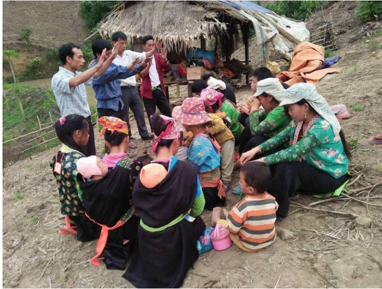
Five H'Mong Christian families, evicted from their home village in Son La Province, holding prayer service near their makeshift tent, May 2017