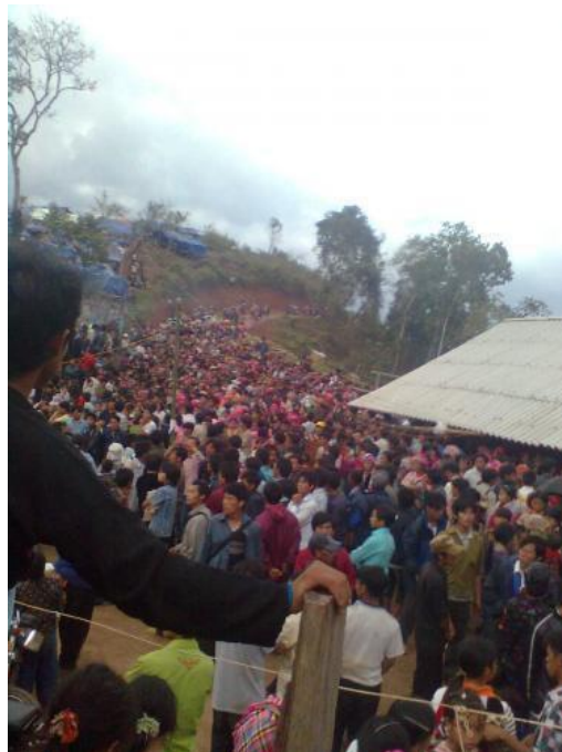
Thousands of H'Mong demonstrators demanding end of land confiscation and religious persecution, May 1, 2011

The next day, the troops launched an all-out assault, using batons and electric rods. 14 According to eye-witnesses, scores of H'Mong demonstrators were killed.