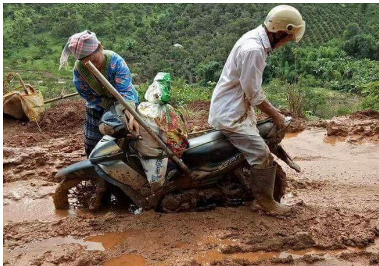
The only road leading to Doan Ket Village became unusable after heavy rain.

National aid and development programs as well as budget allocated for resettling H'Mong who had moved to the Central Highlands have apparently not reached Doan Ket Village. Living conditions in these settlements remain poor. The abominable transportation infrastructure severely hampers travel and commerce. Roads are dusty in the dry season and muddy in the rainy season. Several sick persons and pregnant women have died on the way to hospitals. 12 Few villagers have access to quality health care. Coffee growing, the primary means of livelihood of most villagers, is often affected by the area's inclement weather. Communication infrastructure is very primitive, with no internet and weak cell phone signals. Few local residents are familiar with communication technologies or have access to a computer or a smartphone. A human rights advocate who visited government-managed settlements of displaced H'Mong described them as a Soviet-style “gulag.”