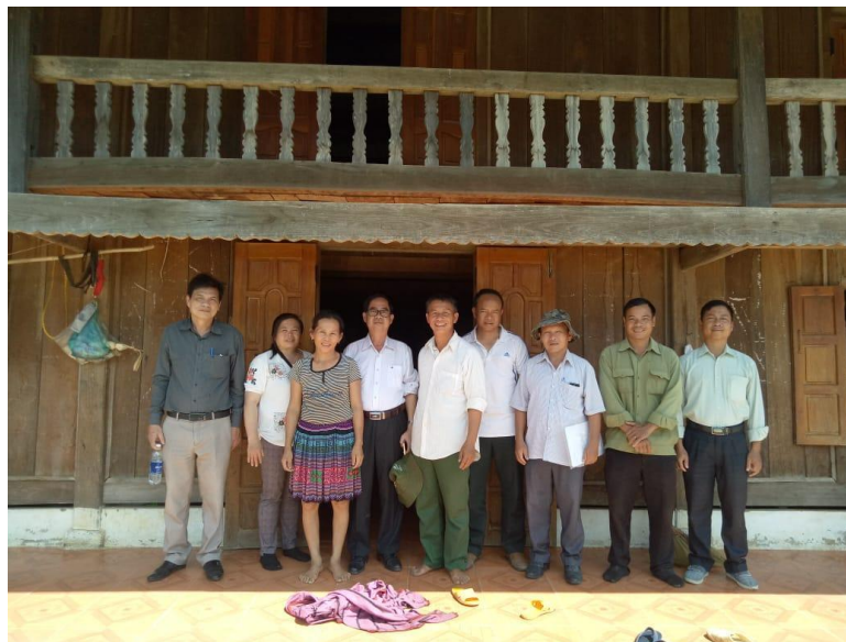
National Assembly members visiting Subdivision 179, July 8, 2020

Responding to a petition by community representatives, on June 10 the Committee on Ethnic Minorities of the National Assembly notified residents of Subdivision 179 their intention to hold a town-hall meeting with all residents. On July 8, two National Assembly members representing Lam Dong Province visited Subdivision 179 to inquire about the “statelessness” situation. While the visit was purely symbolic – the National Assembly has no practical power, it signaled a policy change stemming from the central government or the top level of the Vietnamese Communist Party.