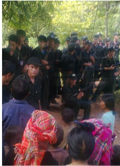
Troops ready to raze the entire H'Mong village of Xa Na Khua, Jan 28, 2011