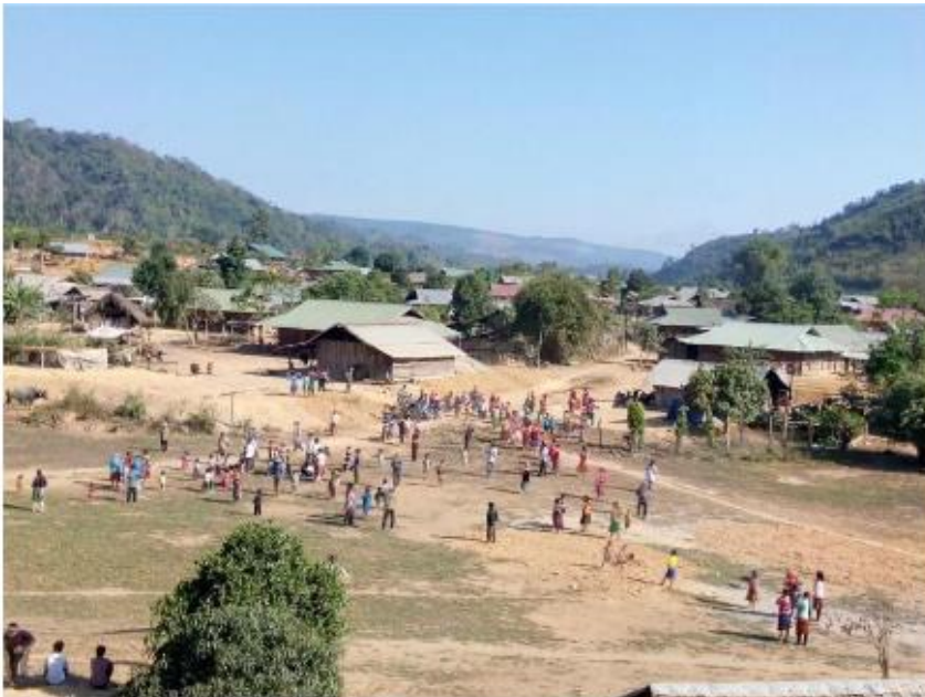
A section of Area 179, Liên Srôngh Commune, Đam Rông District, Lâm Đồng Province

Thanks to international attention, in early 2020, the Government of Dam Rong District, Lam Dong Province signaled a positive policy shift towards the Hmong residents in Subdivision 179 of Lien Sronh Commune. This community of 700 residents was founded approximately two decades ago by Hmong Christians who fled or were evicted from their home villages in the Northwestern Highlands because of their Christian faith after 20 years without any documents.