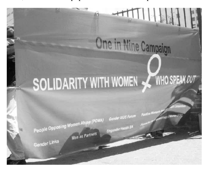
Campaigners, at the time of the trial of Jacob Zuma, highlighting the under-reporting of rape and the pressures on rape complainants.

Finally, in regard to prevention, much more needs to be done by municipal authorities in cooperation with the police, businesses and local rural communities to improve women's physical security by identifying and addressing threats to their safety in the physical environment. AI visited a number of areas where poor or no lighting, high bushes along pathways and inadequate transport links increased the risks of violence for women and girls on a daily basis. Police management could also give greater priority to increasing the level of personnel, vehicles and equipment for rural-based police stations.<sup>86</sup>