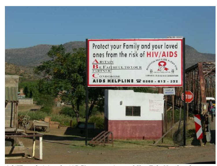
A billboard giving the 'ABC' message in rural KwaZulu Natal and promoting the use of condoms as an HIV prevention method.

support they need, men's threatened or actual use of violence was another critical factor causing the women to give in to the pressure from their partners for unprotected sex and thereby placing themselves at risk of HIV transmission or re-infection.