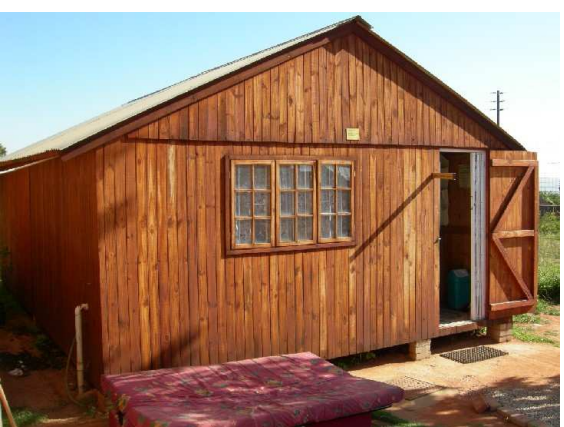
A 'victim-friendly' facility attached to a police station and run by the support organization, GRIP, for survivors of gender-based violence.