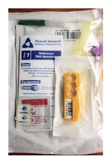
Part of the SAPS Sexual Assault Evidence Collection Kit introduced to improve the gathering of medical evidence by doctors and the management of the chain of custody of this evidence before and after it is handed over to the police.

However a number of concerns remain. The Department of Justice and Constitutional Development appears to have decided not to expand the development of the specialised sexual offences courts. Rape remains a difficult crime to prosecute and requires a high level of training for prosecutors and presiding officers. In the ordinary courts the conviction rates are low. In a recent study of the outcomes of over 2,000 police investigation cases in Gauteng province, 359 of the cases went to trial resulting in convictions for rape in about 87 cases, equivalent to less than five per cent of the original group. 82 Advocacy organizations who were involved in the decade-long process of reforming the sexual offences legislation have expressed concern that the final version of the reformed law has eroded the protections afforded to rape complainants and other vulnerable witnesses contained in the initial draft law.<sup>83</sup> The controversial trial on a rape charge of the former Deputy President, Jacob Zuma, in 2006 vividly illustrated the risks for complainants in seeking justice through the courts. The presiding judge allowed defence counsel to extensively question the complainant about her past sexual history, took into account the complainant's clothing and conduct, measured her behaviour against his assumptions of how a 'real' rape survivor may act and made no comment on the intimidating effect on the complainant of the conduct of