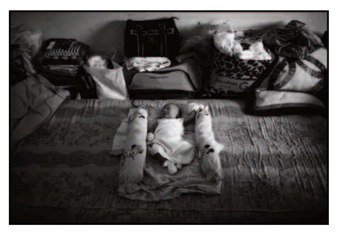
The son of a Filipina domestic worker, only one-month-old, lives with his mother at the Philippines Embassy. Domestic workers who have children in Kuwait face particular difficulties obtaining the legal clearances necessary for these children to leave the country and travel to their mothers' home country—a process that can take years.

residency permit at any time. By delegating to individual employers the power to determine a worker's immigration status—tying a worker's ability to be legally present in the country to the satisfaction of her employer—lawmakers have ignored the exploitative potential inherent in these regulations. Workers desperate to earn money fear retaliation, cancelation of their visas, and deportation should they attempt to pursue claims of contract violation or abuse.