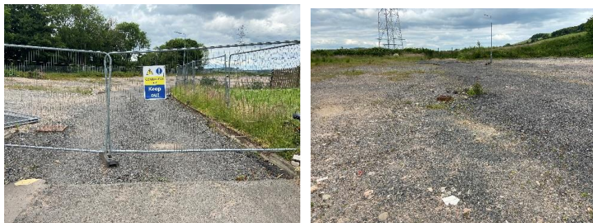
Photos 2 and 3 of the derelict site at Tarvit Mill where renovation work has been stalled.

The cumulative effect of the failure to move forward with site improvements in a timely way means that tenants are experiencing significant and deteriorating human rights impacts.