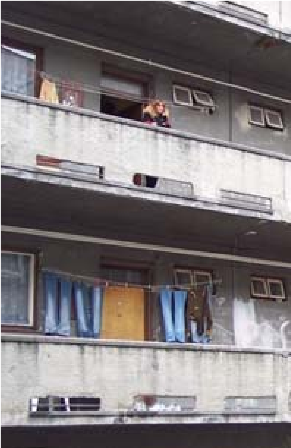
Living conditions in the town of Vsetin for the Roma and the unsanitary conditions in which they dwelled before the forcible expulsion.