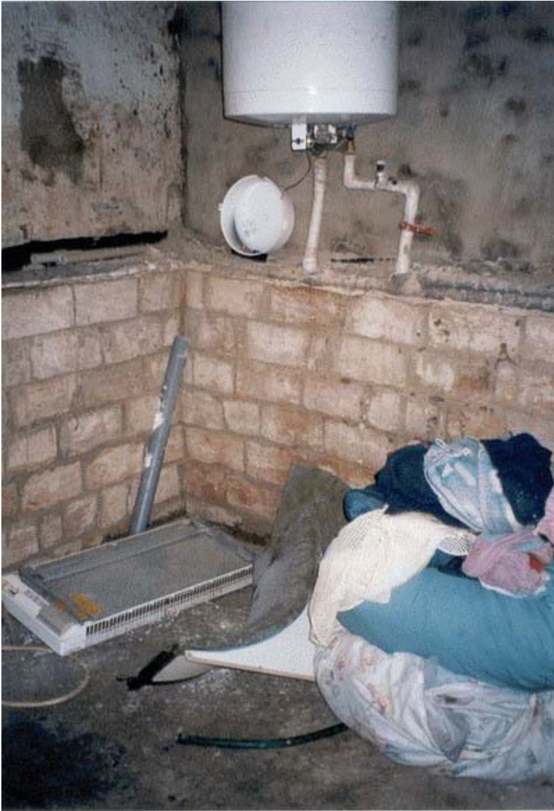
Bathroom facilities with a boiler in the house in Stará Červená Voda in the Jeseník District, Czech Republic, 13 May 2007, to which two families were deported by the Vsetín municipality after being expelled from municipal housing without procedure in November 2006.