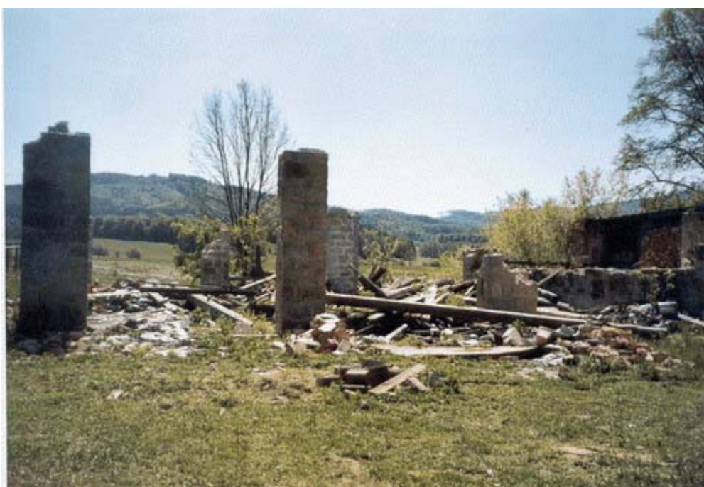
A former barn, part of the “housing” provided to the two Romani families forcibly expelled by the Vsetin local authority in November 2006 to Stará Červená Voda in the Jeseník district, Czech Republic, 13 May 2007.