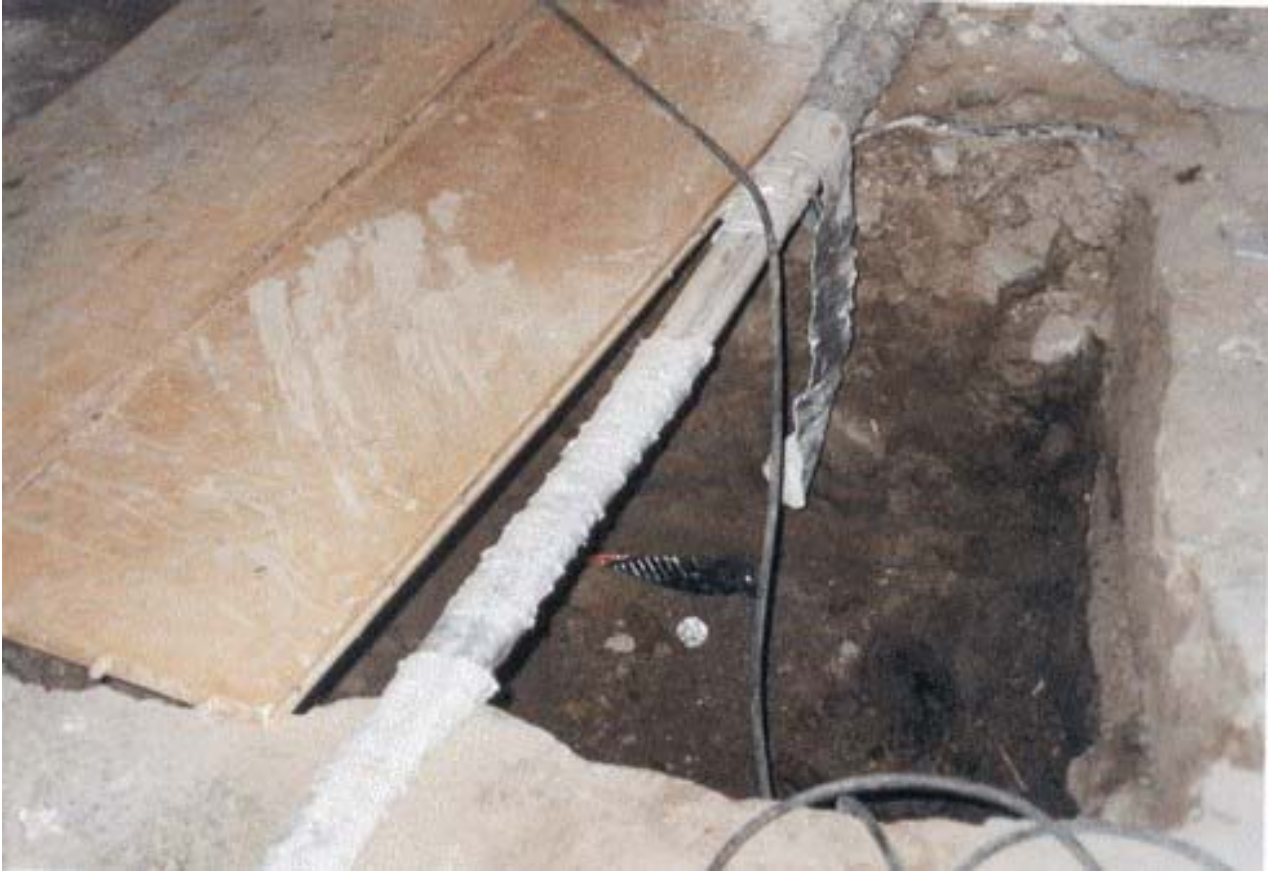
A large hole in the house in Stará Červená Voda where the two Romani families have lived since they were forcibly expelled by the Vsetín municipality. Since the deportation in November, the families have been without potable water.