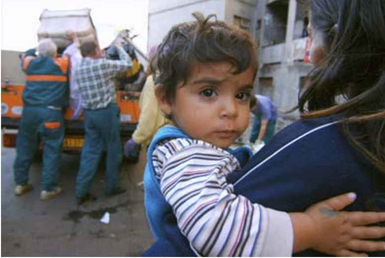
Unnamed mother with child, reprinted from article titled “Resettled Czech Romanies Want Flats from Vsetin”. 18 June 2007.