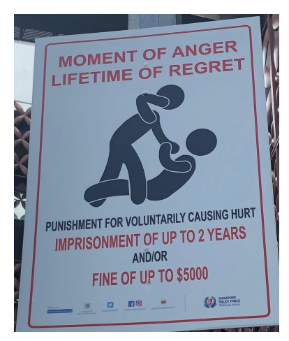
Image 2: A poster in Little India warning individuals against causing hurt to others (picture taken 23 October 2021).

exacerbate the distrust and negative stereotypes held of the migrant populations amongst the Singaporean public.<sup>77</sup>