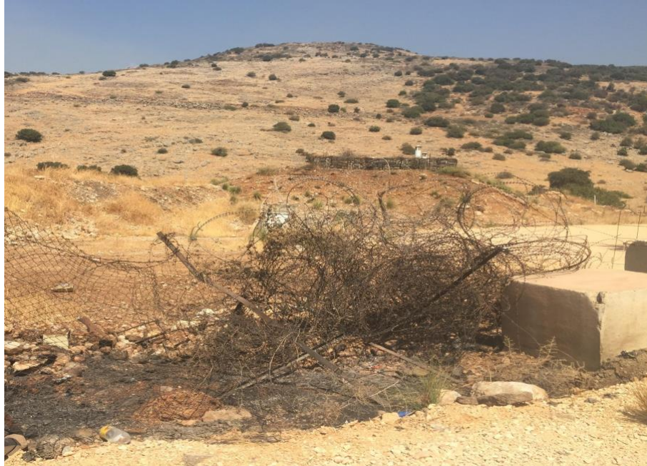
A broken fence surrounding a minefield

In the wake of Al-Marsad's 2018 report to this Committee, Israel cleared some of the landmines around Majdal Shams. Al-Marsad welcomes this development. At the same time, Israel has failed to take steps to clear the remaining landmines that surround Syrian Arab fields and lurk under the land, creating a constant danger of death or dismemberment.