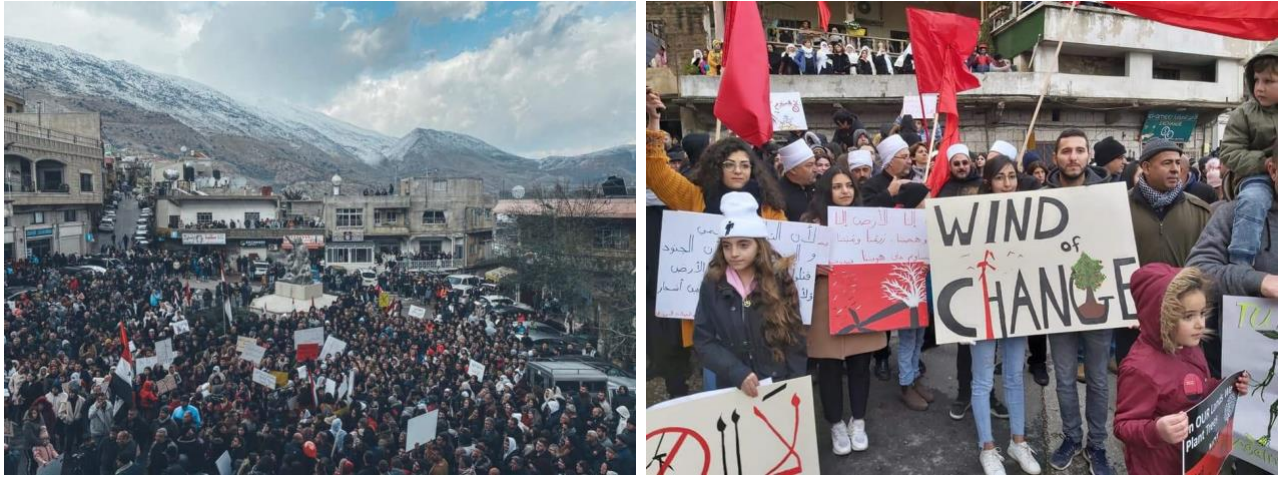
Protestors at Majdal Shams Main Square on January, 2020