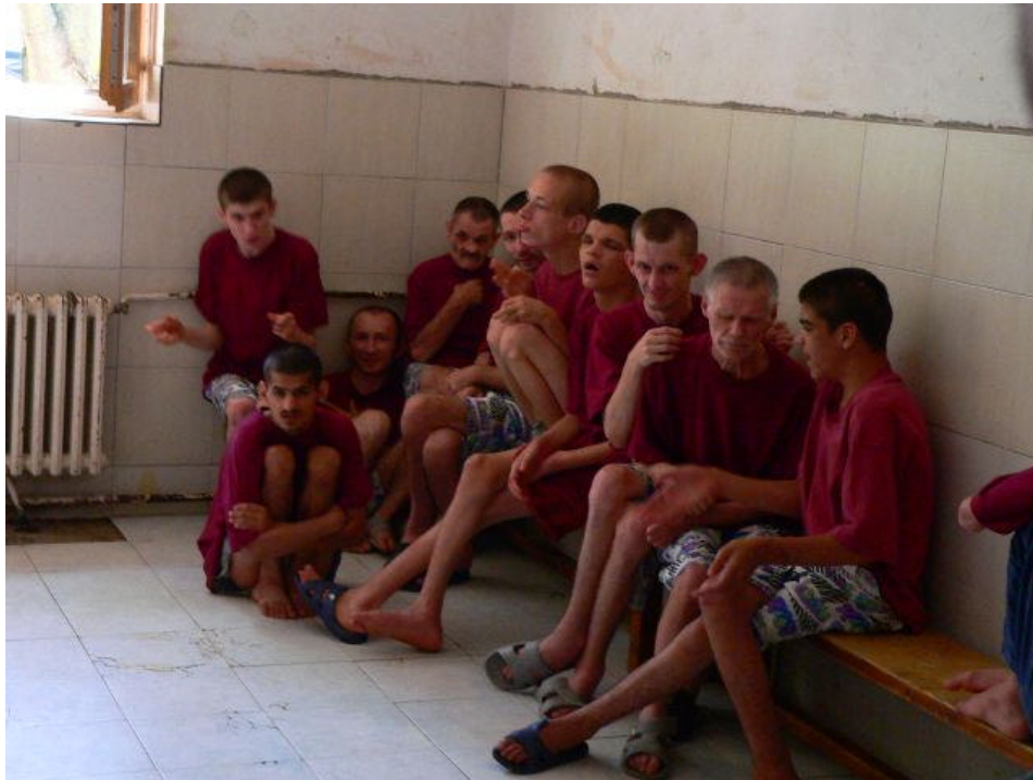
7. Boys and men with developmental disabilities are kept in a barren and bleak room all day in Kulina. Photo Marc Schneider 2007