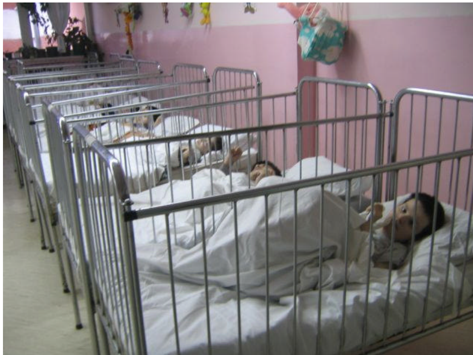
2. Children and young adults labeled "immobile" spend years lying in cribs in Stannica, never getting out.