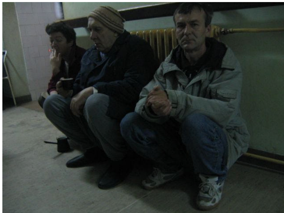
4. Residents at Curug Institution, wearing winter coats and hats indoors, huddle by a radiator to try and keep warm.