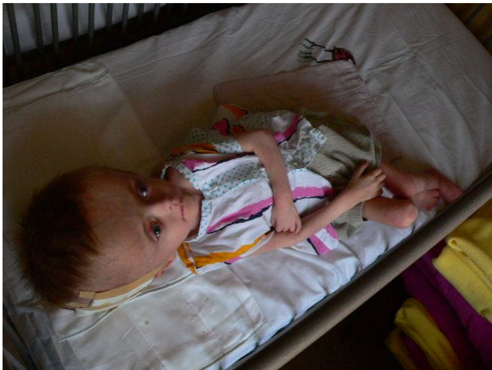
6. MDRI investigators found this 7 year old girl, with untreated hydrocephalus, in Kulina. Staff reported that medical treatment was withheld at her birth because doctors advised against it because “she will die anyway.”