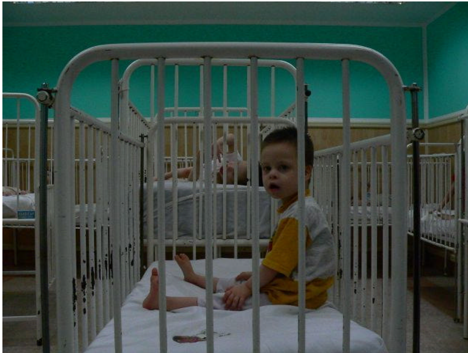
5. Rows and rows of neglected children alone in cribs at Kulina. Photo Marc Schneider 2007