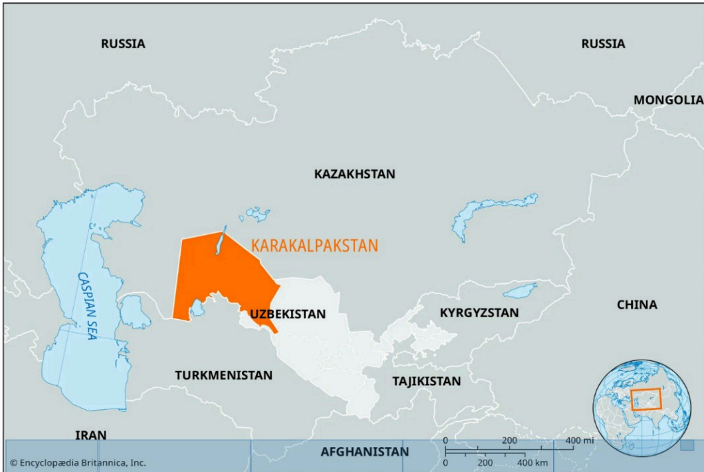
Figure 1: Location of the Sovereign Republic of Karakalpakstan within Uzbekistan

The map illustrates the northwestern position and substantial territorial extent of the Sovereign Republic of Karakalpakstan within Uzbekistan.