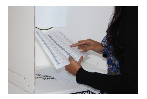
Step 5 Circle or Tick or Cross the number of the candidate of your choice

Use the Voter Instruction Booklet to find the number of the candidate you would like to vote for