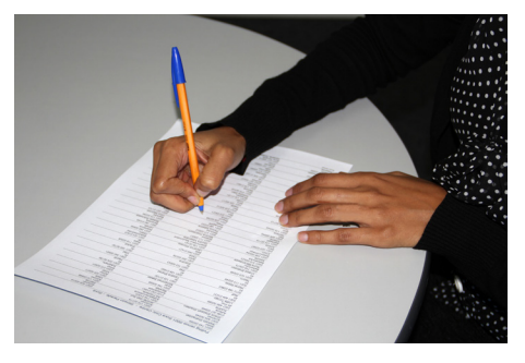
Step 3 After the voter signs on the Voter List, he/she will be issued with a ballot paper which he/she will take to the voting screen