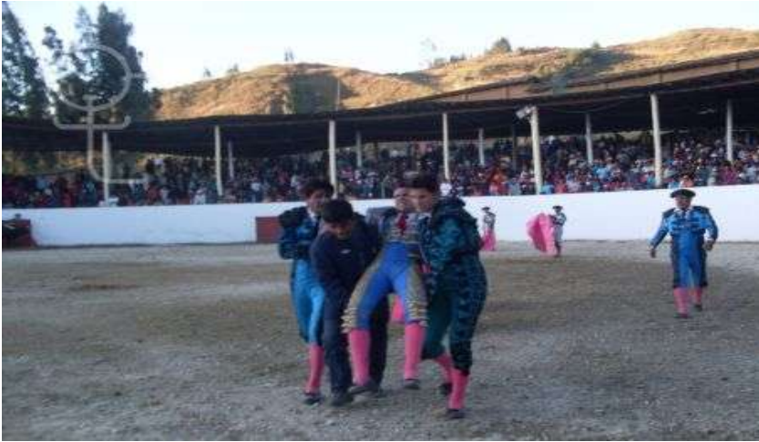
Huanca, Ancash. 23/8/2014. A bullfighter and participant are gored and seriously injured. http://elcomercio.pe/peru/ancash/huanca-hombre-se-desnudo-y-desafio-varios-toros-noticia-1752024