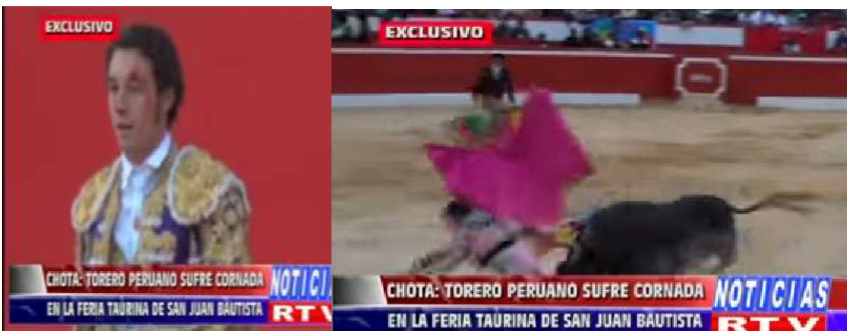
Chalhuanka, Apurímac. 27/7/2014. Bullfighter injured as a result of 25 cm. deep gore in the right thigh. http://www.opinionytoros.com/noticias.php?id=47909