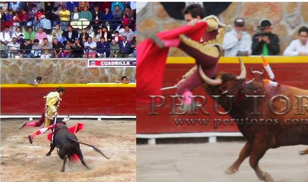
Cajabamba. 17/10/2014. A bullfighter is seriously gored. http://www.tauromaquias.com/2014/10/el-sabado-comienza-la-feria-del-senor.html