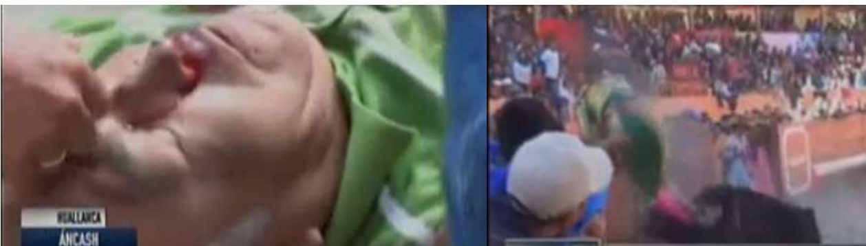
Cajabamba. 17/7/2014. A bullfighter is seriously gored, the horn entering the testicle and damaging the spermatic cord. http://www.opinionytoros.com/noticias.php?id=47751