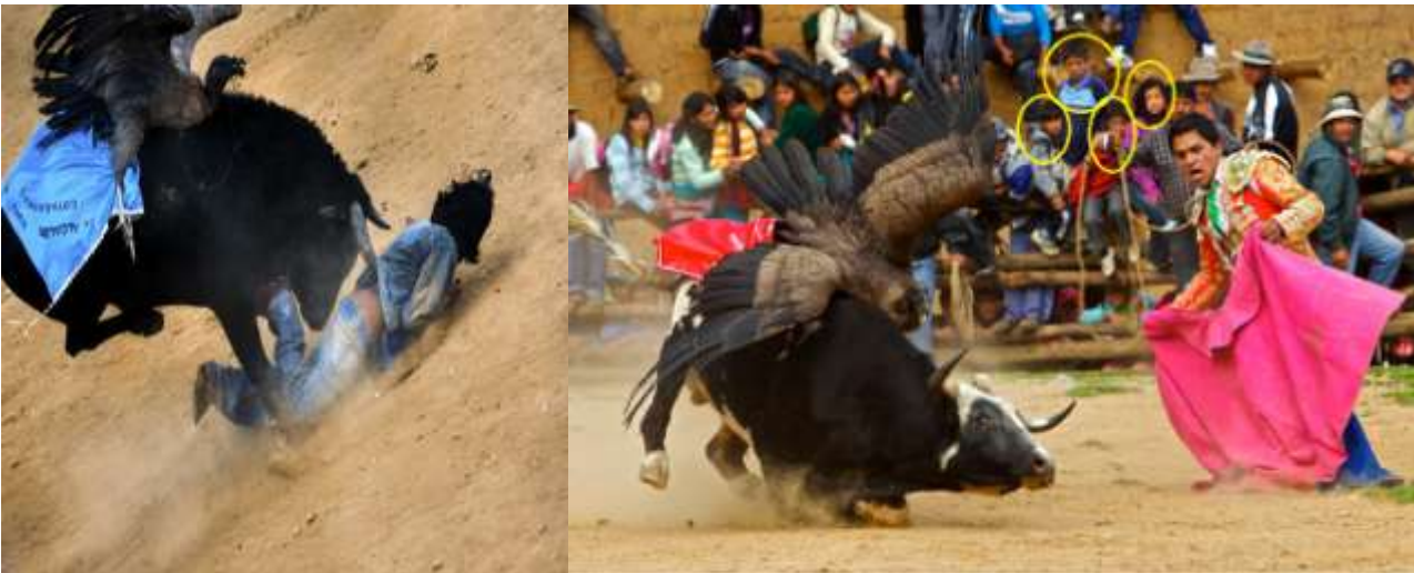
Chalhuahuacho, Apurímac. 26/6/2014. A participant in a bullfighting festival dies after being gored. http://www.rpp.com.pe/2014-06-26-hombre-dejo-de-existir-tras-cornada-de-toro-en-apurimac-noticia_703396.html

- “Yawar fiesta o Yawar Toro. “Festival of Blood”. Apurímac, Abancay. 30/7/2012 and 26/7/2013.