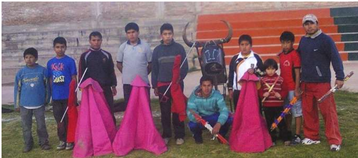
Chuquibamba Bullfighting School

For further information, full details of all the bullfighting schools are available: location, director, age of admission, methodology and training schedules, joining fees, contact details and telephone.