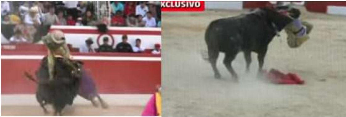
Chumbivilcas Cusco. 3/7/2013. Amateur bullfighter dies after suffering violent blows from the bull. http://www.larepublica.pe/06-07-2013/cusco-torero-aficionado-muere-por-cornada-de-toro