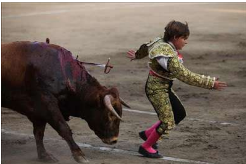
Child bullfighter (Plaza de Toros de Acho -Acho Bullring-Lima)

The State party tolerates, consents and authorises the performance and participation of children in bullfights are subjected to a form of exploitation by adults that harms their welfare, in that it compromises their physical and psychological integrity. This activity takes place within a work setting, which means that this is also economic exploitation, in which case it is advisable to apply the 1999 Convention concerning the prohibition and immediate action for the elimination of the worst forms of child labour (Convention no. 182) ILO (UN), to which end, “the worst forms of child labour” covers “work which, by its nature or the circumstances in which it is carried out, is likely to harm the health, safety or morals of children”. According to the UN Study on Violence Against Children (UNVC) (2006), “where violence is an integral component of the hazardous and exploitative nature of the labour, children should not be in the workplace.”