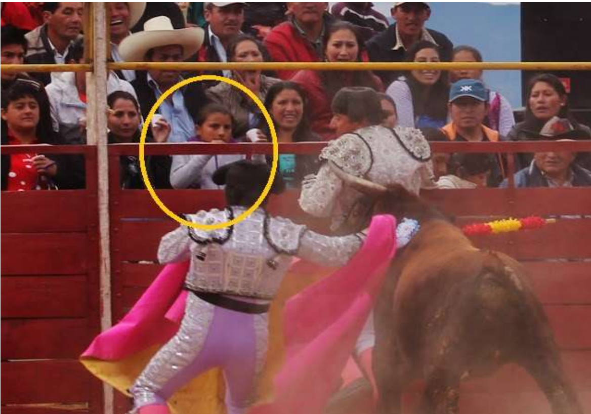
Chota, Cajamarca. 27/6/2013. The bull charges, wounding horse and rider.

http://www.perutoros.com.pe/2013/07/clavito-casi-prendido-en-querocoto.html