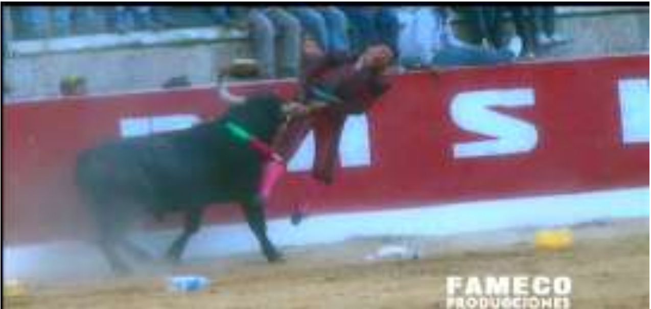
Querocoto. 16/7/2013. A bullfighter is helped by his colleagues.