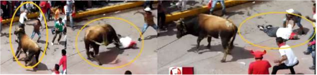
10/6/2014. People seriously injured by goring during bullfighting festivities. http://diariocorreo.pe/ciudad/jovencito-estuvo-a-punto-de-perder-miembro-v-27554/

- “Yawar fiesta o Yawar Toro. “Festival of Blood”. Apurímac, Abancay. 30/7/2012 and 26/7/2013.