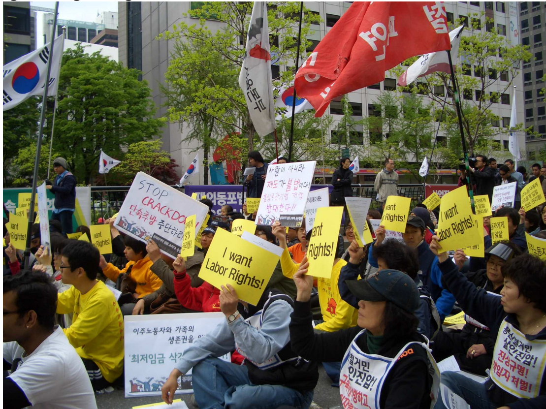
Figure 4: 2009 migrant workers' May Day rally in central Seoul (AI)

These statements go against the government's assertion that the immigration authorities act on behalf of local residents who ask for the government to crackdown against irregular migrant workers. 131