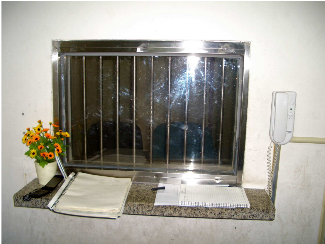
Figure 9: Visiting booth at Hwaseong detention centre (AI)

JK, a 27-year-old Bangladeshi male, had also been in detention for four days, during which time he was “only allowed to exercise once and for just a short time, maybe 10 minutes maximum”.