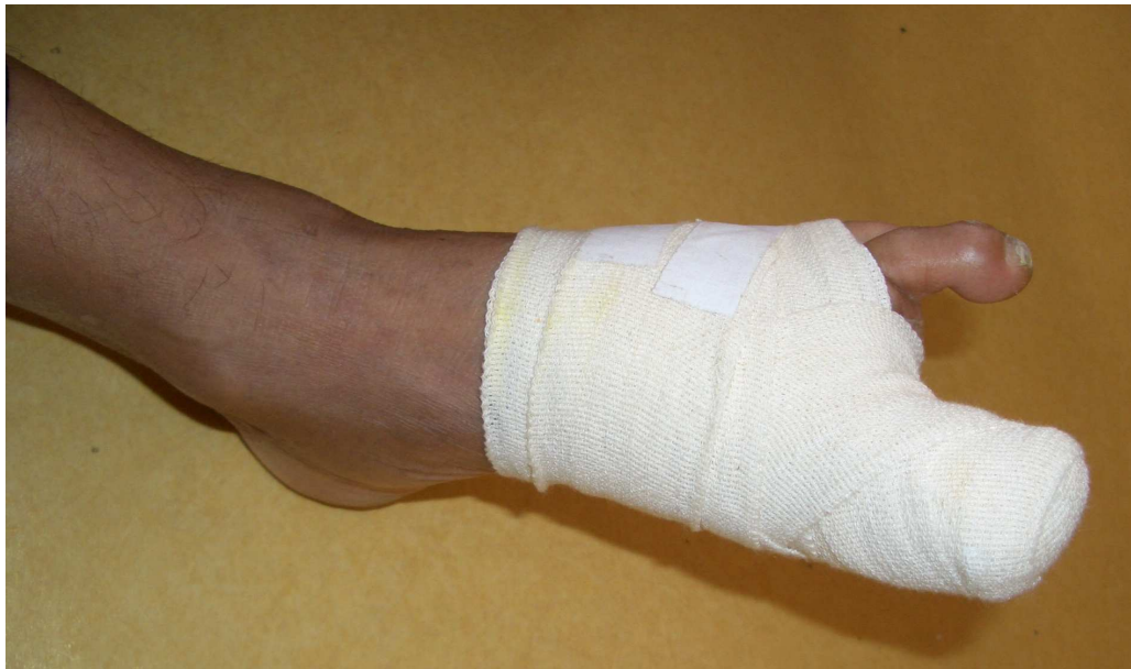
Figure 13: RM, a 44-year-old Bangladeshi man, had his second and third toes amputated after a 500 kg piston ring fell on his left foot (AI)

“Migrant workers can’t speak Korean and there are no interpreters at many of the workplaces. So, employers don’t bother offering training. Compared to Korean workers, work conditions for migrant workers are much worse. For example when working with chemicals, migrant workers often work without safety equipment and in poorly ventilated factories. A South Korean worker in that situation would either refuse to work under those conditions or complain to have the situation changed.” 262