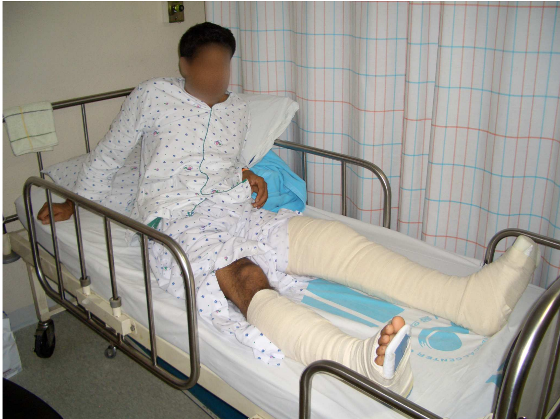
Figure 8: EM with multiple leg injuries at Seoul Medical Centre (AI)

According to EM's testimony, immigration officers took him to the Seoul Medical Centre on 15 November 2008, gave him temporary leave to remain (G-1 visa) 177 until May 2009 and told him that the Immigration Service was not responsible for him or his medical costs, and that he was on his own. 178