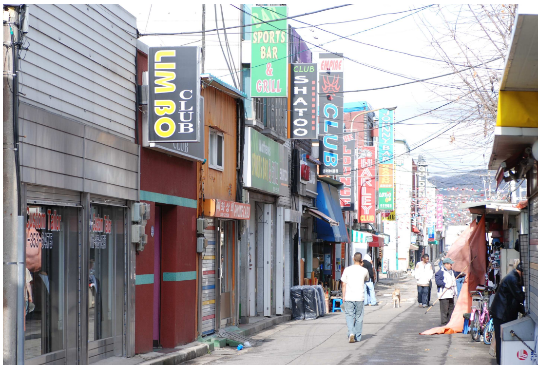
Figure 15: Gijichon or US military camp town in Dongducheon (AI)

As interviews demonstrate, they find out once they arrive in South Korea that their job in reality is to serve and solicit drinks from male US soldiers, which often involves clients groping or kissing the women without their consent. At some establishments, E-6 workers are forced to have sex with their clients. 303 But by this time, the women feel compelled to yield to the pressure to continue working in the given circumstances because they are already in debt to their employer for their flight ticket, visa costs, agent's fee, food and accommodation. As their main objective is to earn money and support their family, they have little choice but to remain. 304