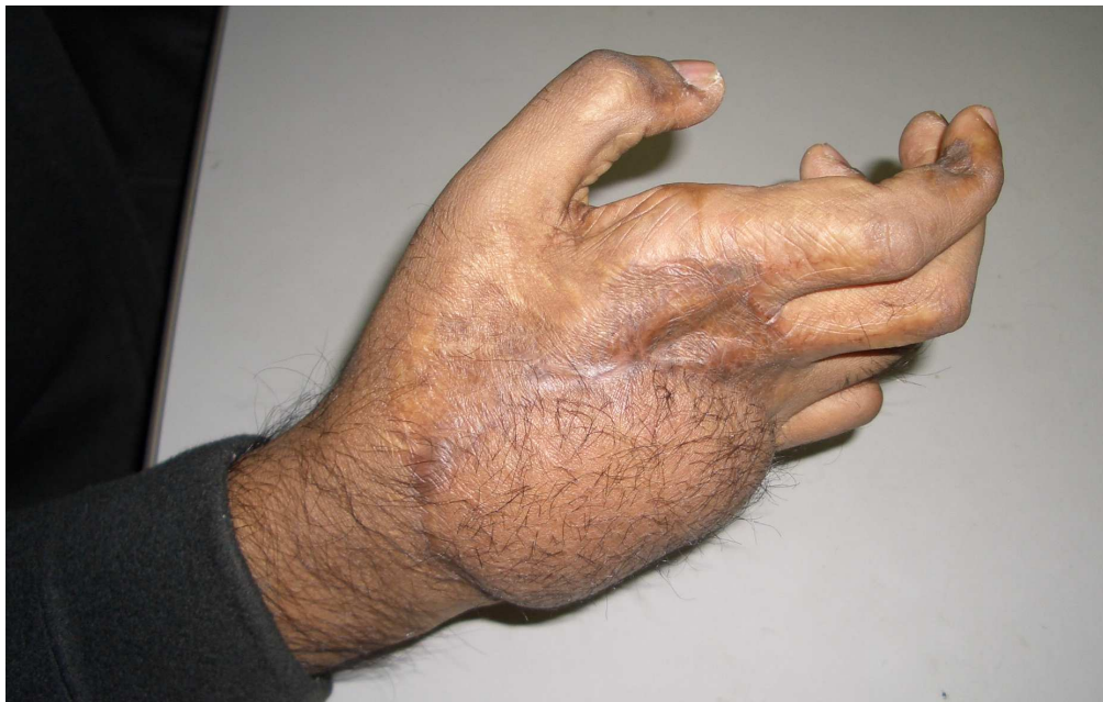
Figure 14: BR suffered severe burns when his hand got stuck in a press machine with a faulty switch (AI)

BR was not able to work for two years and during this time, he had to live with various friends as he had no accommodation. His medical costs were covered by his company’s Industrial Accident Compensation Insurance. 280