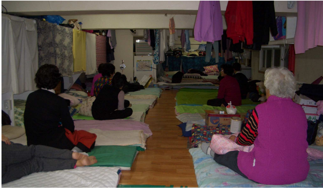
Figure 1: Women's shelter at the Korea Migrants' Centre in Seoul (AI)