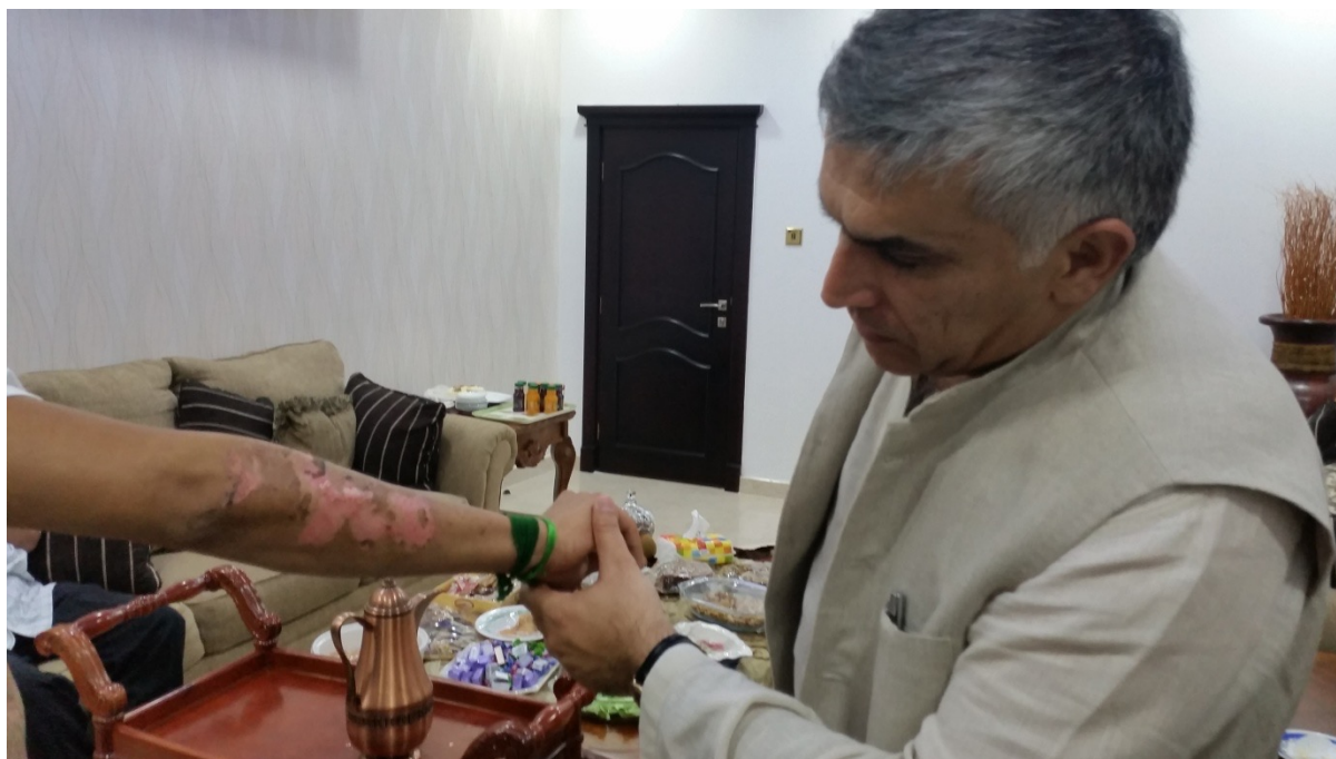
Nabeel Rajab, President of the Bahrain Center for Human Rights, examining the injuries of an ex-inmate recently released from Jau Prison, Bahrain.

In the weeks following the riot, police transferred over 100 inmates across the prison complex to Building 10, where police subjected them to sustained torture and ill-treatment. A large proportion of these inmates were peaceful activists who had protested against overcrowding in the weeks before the riot; the police now targeted these individuals for mistreatment on the suspicion that they instigated the disorder. They sectioned off these inmates and arbitrarily tortured them. Abdulhadi al-Khawaja, a human rights defender serving a life sentence in Jau Prison, wrote in a letter to the UN High Commissioner of Human Rights that "Building 10 has become known as the torture building."