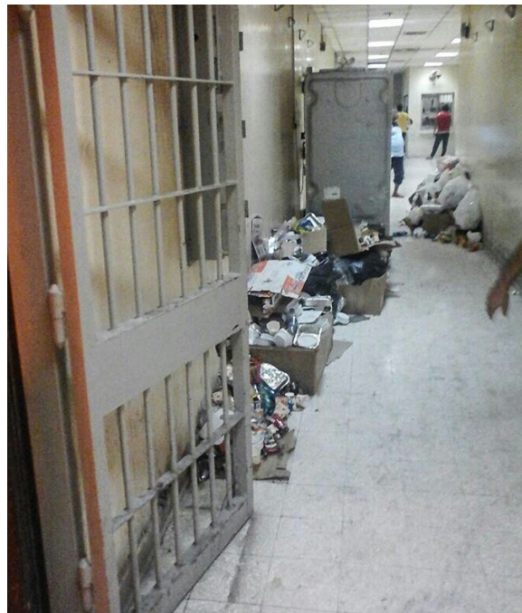
Filthy standards of living including dirty toilets and rubbish filled corridors. Jau Prison, Bahrain