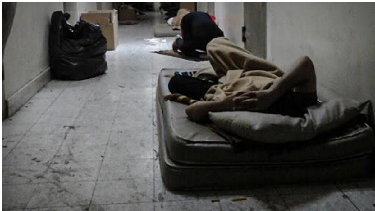
Inmates sleeping in prison corridors due to overcrowded cells. Jau Prison, Bahrain.

Jau Prison has been substantially overcrowded for at least two years. After his visit in 2013, the Ombudsman calculated the only official figures on the prison population. His office reported that the prison had a capacity of 1201 persons, but housed 1608, representing that Jau prison was approximately 34% over capacity by official numbers. At the time of Ombudsman's visit in 2013, Jau Prison was composed of seven housing buildings, a visitation centre, and several administrative buildings. Since 2013, three new buildings have been constructed to house inmates, for which no data exists. However, inmates