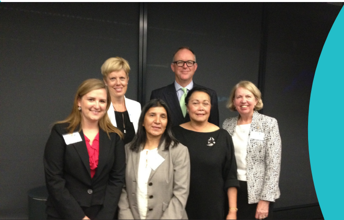
Participants at the Sydney Welcome Reception co-hosted by UN Women Australia, Allens Arthur Robinson and the Australian Human Rights Commission.