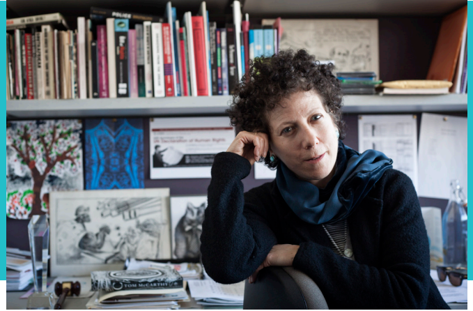
Andrea Durbach Former Deputy Sex Discrimination Commissioner Australian Human Rights Commission

In 1994, the United Nations Commission on Human Rights appointed a Special Rapporteur on violence against women, including its causes and consequences. The mandate was extended by the Commission on Human Rights in 2003, at its 59th session in a resolution that, inter alia, affirmed that violence against women constitutes a violation of the human rights and fundamental freedoms of women and impairs or nullifies their enjoyment of those rights and freedoms. Almost twenty years later, in April 2012, the current UN Special Rapporteur on violence against women, including its causes and consequences, Ms Rashida Manjoo, accepted an invitation to conduct a study tour to Australia. This was the first visit to Australia ever undertaken by the UN Special Rapporteur on violence against women.