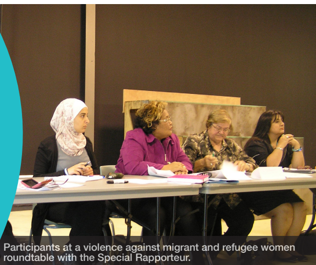
Participants at a violence against migrant and refugee women roundtable with the Special Rapporteur.

On 11 April 2012, the Australian Human Rights Commission hosted a roundtable on violence against migrant and refugee women at the Bankstown Arts Centre in Sydney. The roundtable was attended by approximately 16 representatives of migrant and refugee women groups from Canberra, Melbourne and Sydney. Settlement Services International facilitated the roundtable.