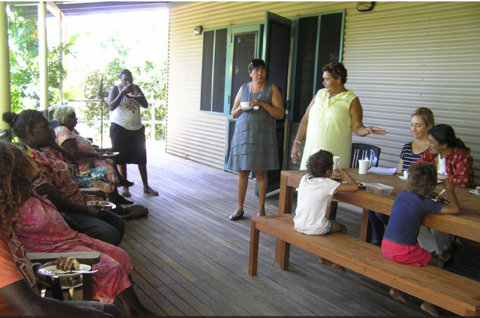
Participants at a violence against Aboriginal and Torres Strait Islander women roundtable in Fitzroy Crossing, WA.