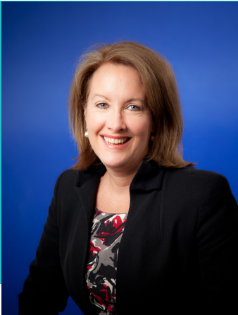
Elizabeth Broderick Sex Discrimination Commissioner Australian Human Rights Commission