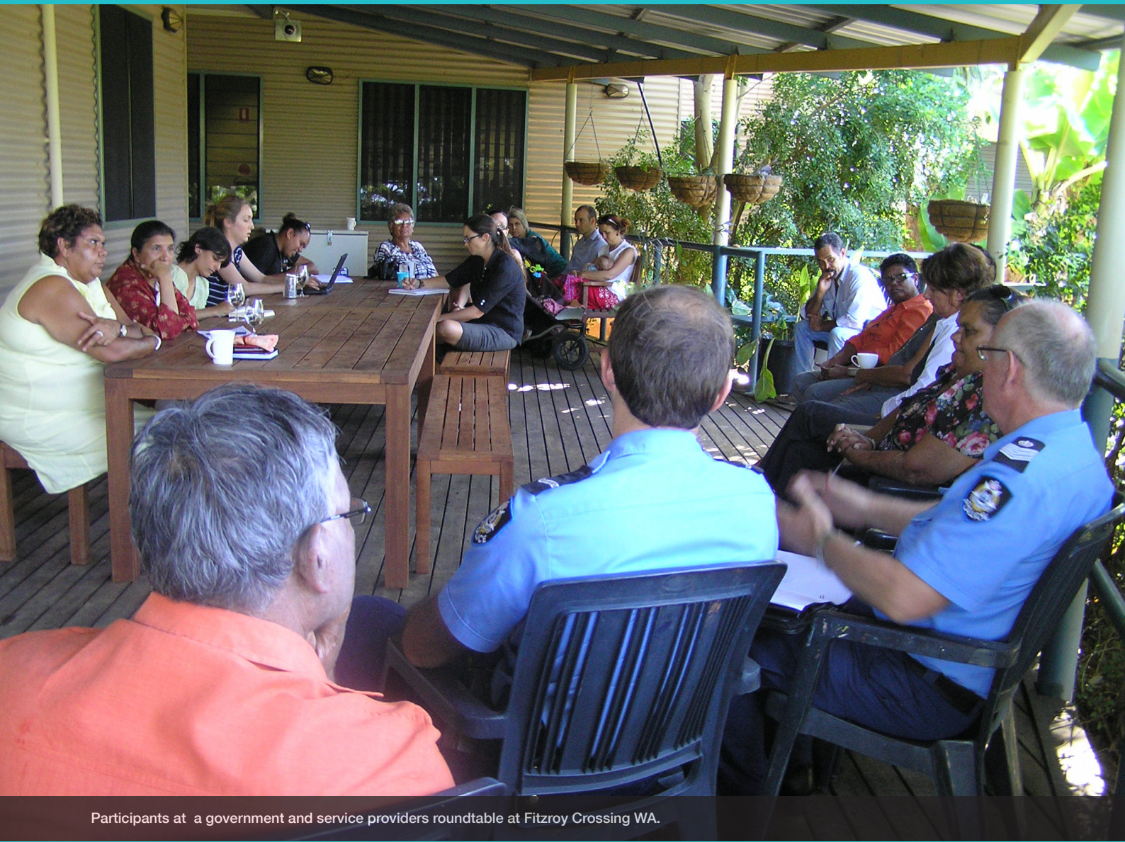
Participants at a government and service providers roundtable at Fitzroy Crossing WA.