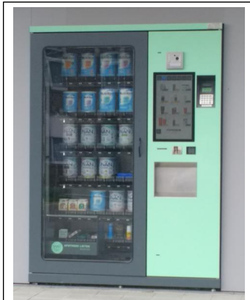
A vending machine at the pharmacist. Place: Binkom (Lubbeek). Date: 3 Aug. 2017