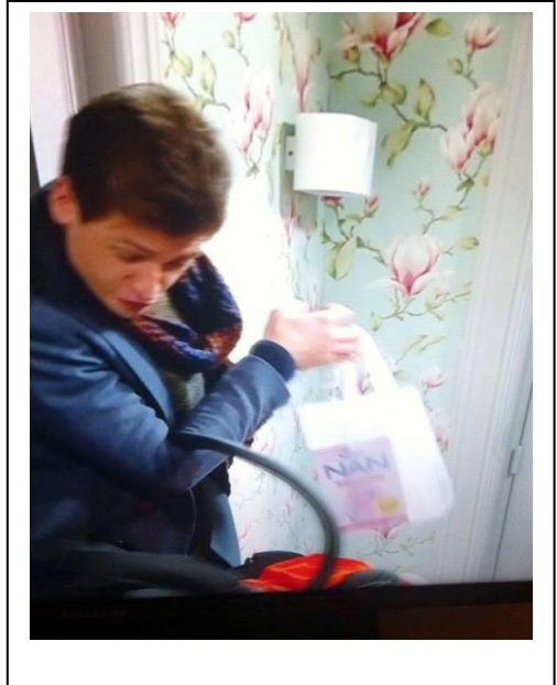
Product placement. VRT 20 January 2016. In the soap "Thuis" (At home): the doctor has prescribed other formula since the (formula fed) baby was crying a lot. One don't get a transparent bag at the pharmacist.