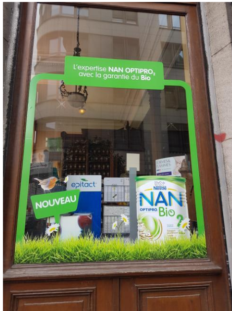
The window of a pharmacist: to announce new bio product. Kruidtuinlaan, Brussels, June 2018