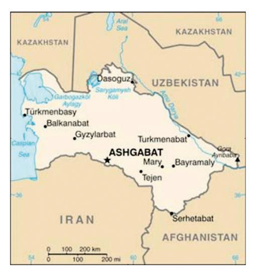
Dashoguz is located in the very North of Turkmenistan.