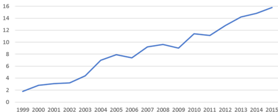
Percentage of enrollments in primary education in private schools in Mauritania (%)

The share of students in the private education sector has increased more than eightfold in only 16 years. 1 A phenomenon of this magnitude necessarily requires special attention and support to ensure that it does not undermine the right to education.