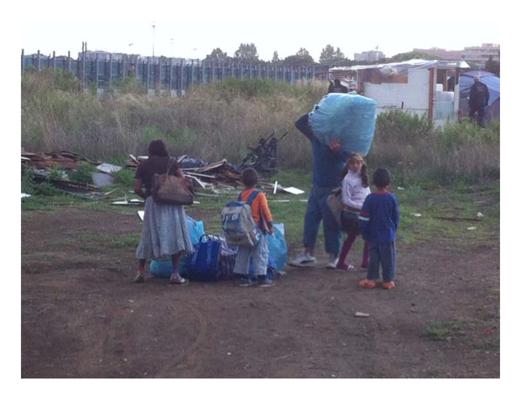
Forced eviction of families living in the informal camp of Via Salviati, Rome, 12 September 2013. Over 500 forced evictions were reported in Rome in the past five years.