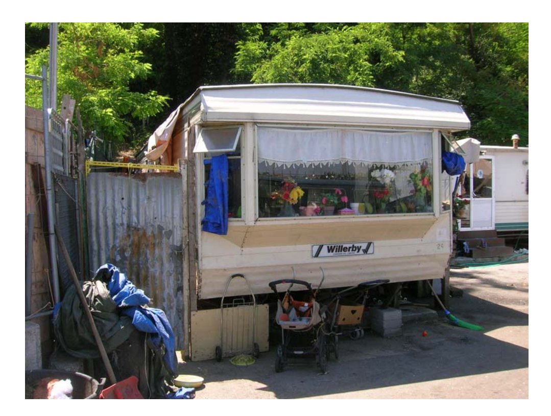
A mobile home in Candoni camp, Rome, June 2013. When the Casilino 900 camp was closed in 2010, about a hundred of its residents were transferred to Candoni, where a total population of almost 900 is currently housed.

Amnesty International urges the national government to progress with the implementation of the 2012 National strategy for Roma inclusion, in particular by taking measures to review the obstacles to Roma's access to social housing and to ensure their effective access (as foreseen under Specific Objective 4.1 of the National strategy).