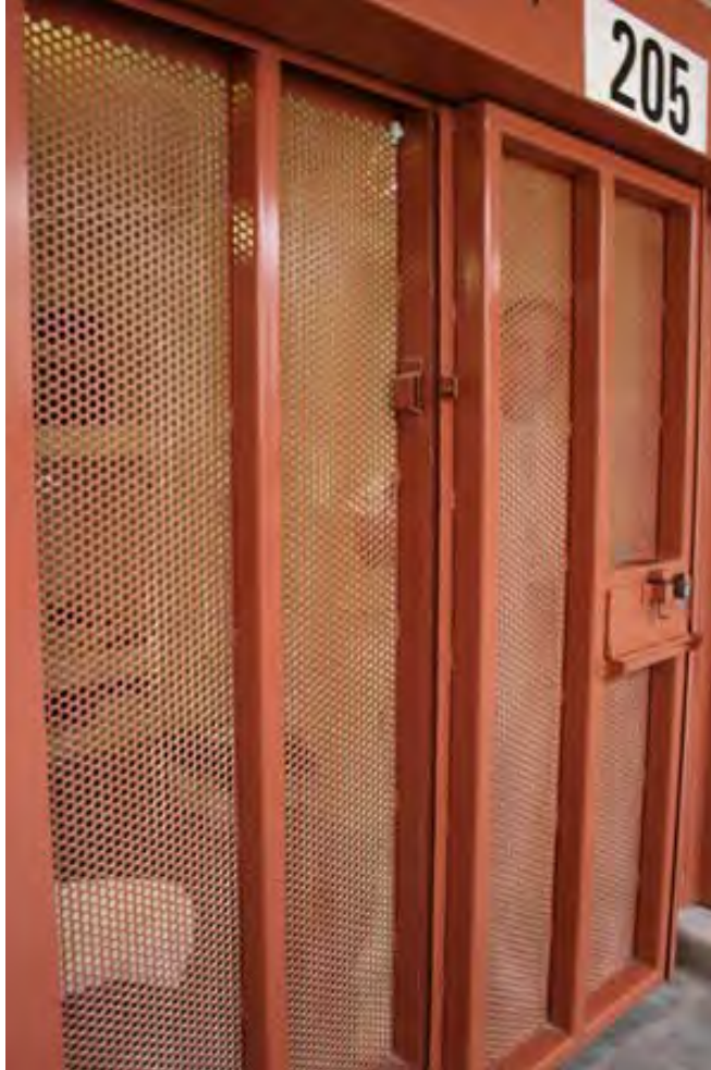
A SHU inmate peers out of his cell.

stimulation", including, where possible, more out-of-cell time and opportunities to exercise in the presence of other prisoners (23-3.8 (c)). The standards also recommend a number of procedural protections for prisoners placed in segregated housing, including a hearing at which the prisoner has a reasonable opportunity to present witnesses and information and to participate in the proceedings, with regular, meaningful review (23-2.9).