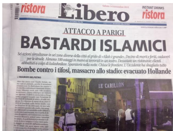
“Libero”, 14 November 2015 11

46. Below some examples on how the media can accentuate the tension, hatred against migrants and Islamic communities: