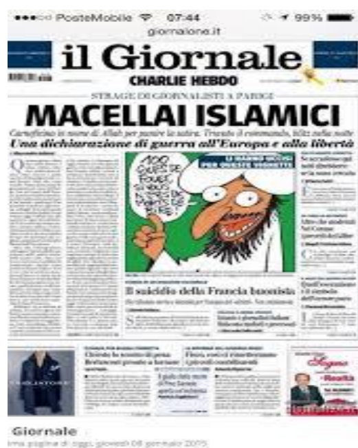
“Il Giornale”, 8 January 2015

http://www.liberoquotidiano.it/news/editoriali/11848405/Belpietro--Bastardi-islamici.html