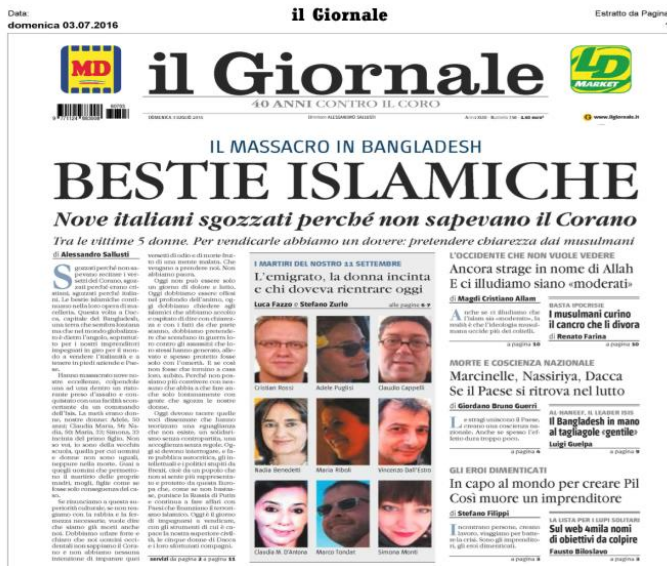
“Il Giornale”, 3 July 2016

http://www.ilgiornale.it/news/cronache/bestie-islamiche-1278564.html